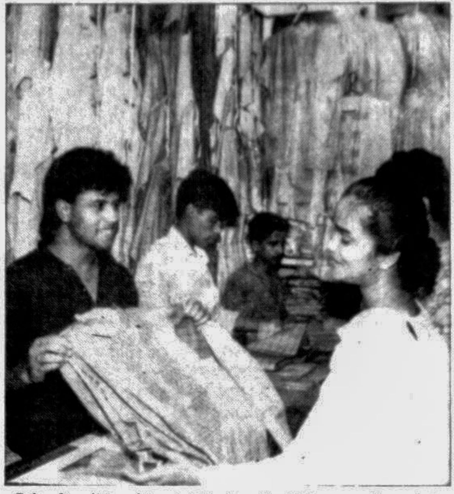
Sale of traditional 'punjabi' before the Eid.

The messages so far received are from King Hussein-I of the Kingdom of Jordan, President Hafez al-Assad of Syria, President Omar Hassan Ahmed al-Bashir of Sudan and Chairman of the Armed Forces Provisional Ruling Council, Captain Yahya A J Jammeh of the Republic of Gambia.