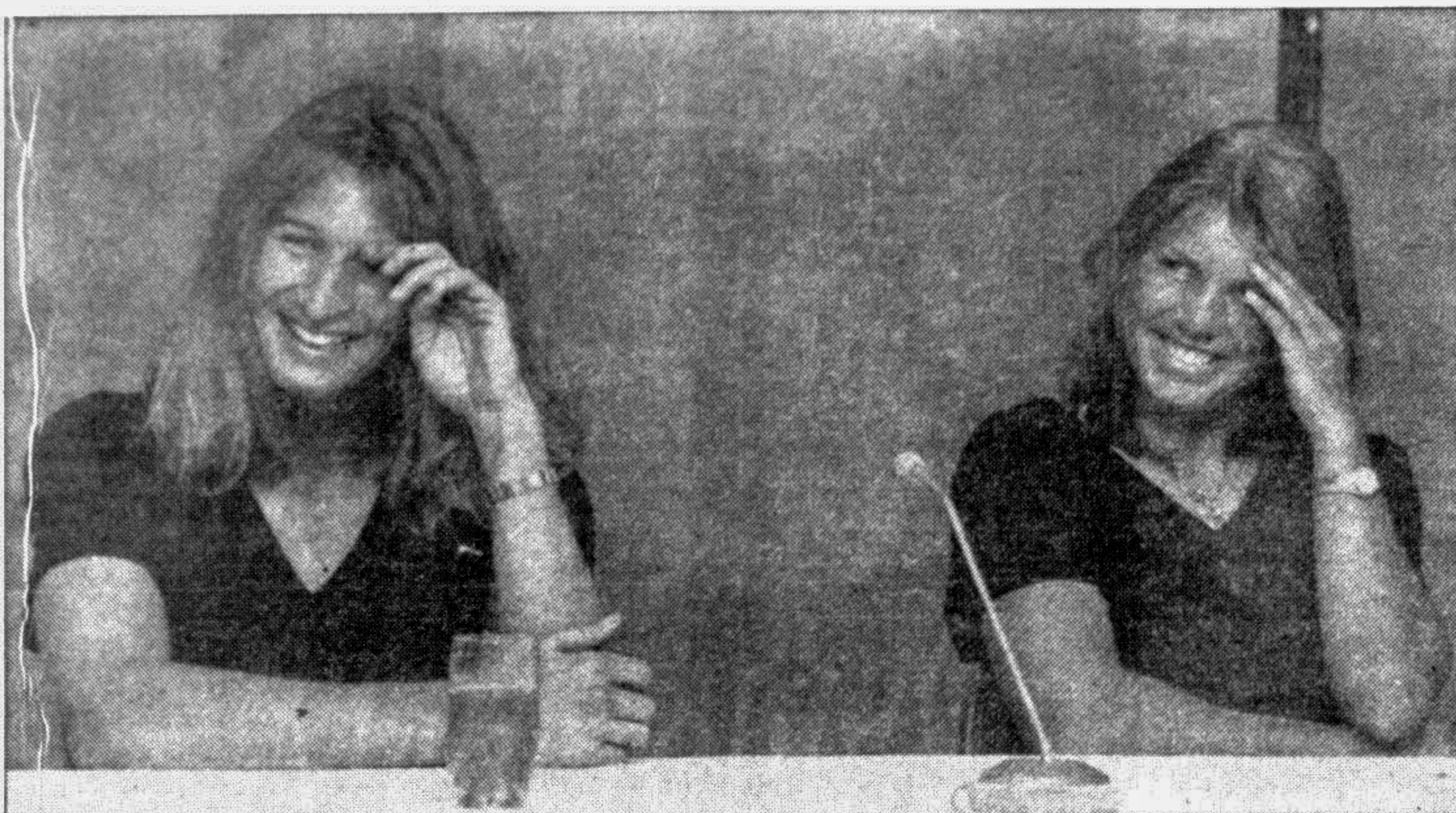
World No 1 Steffi Graf and compatriot Anke Huber smile while talking to reporters at a press conference in Tokyo yesterday after the draw for the Federation Cup '96 World Group first round encounter between Germany and Japan was made.

Ramos flew to the southern city of General Santos to launch the three-day competition, saying they were intended to expand "Our relations beyond just economic co-operation and trade to people-to-people interaction."