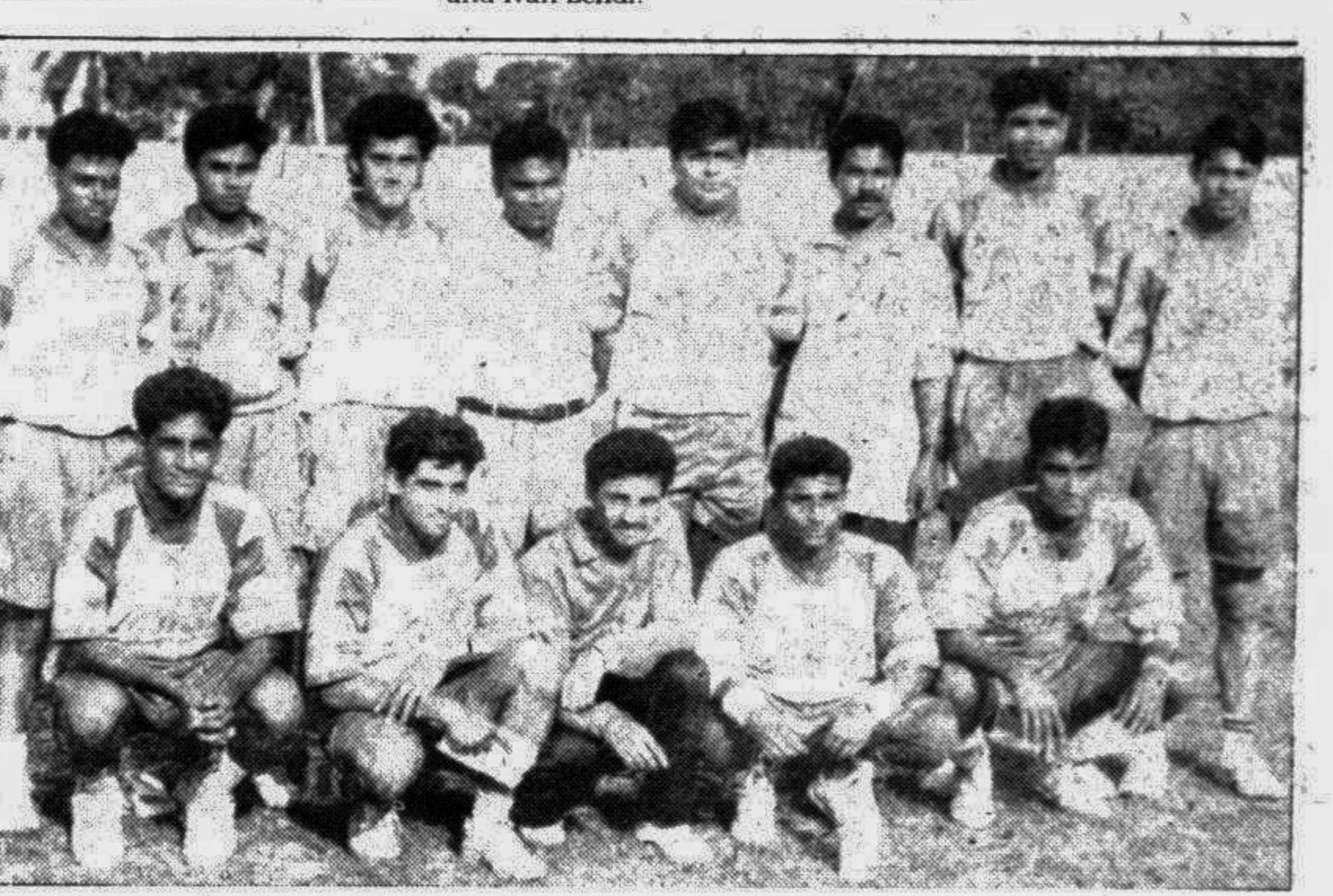
Members of the Ashraf Real Estate handball champions Old Ideals.

MONTE CARLO, Apr 25: American Pete Sampras, who ended last year as the world number one in the ATP Tour rankings, has been voted tennis player of the year for a third year running, by a jury of players and officials, reports Reuter. Sampras, who won Wimbledon and the US Open for the third time in 1995, is only the third player to be voted player-of-the-year three times after compatriots Jimmy Connors and Ivan Lendl.