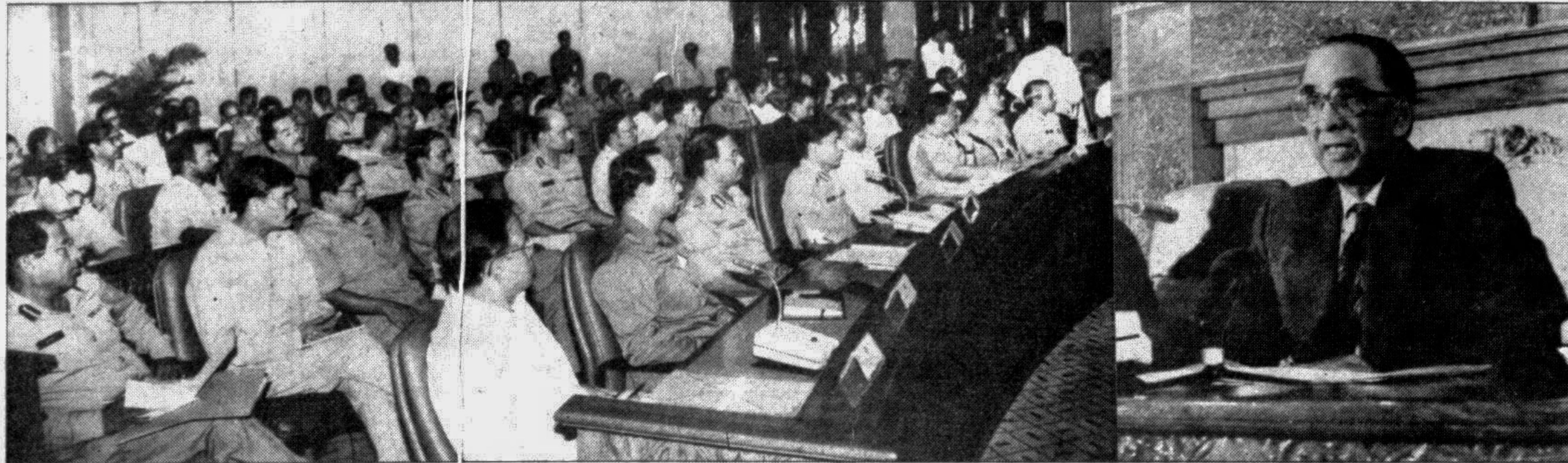
Chief Adviser Muhammad Habibur Rahman addressing the deputy commissioners and superintendents of police at the International Conference Centre in Dhaka yesterday.

JAHANGIRNAGAR UNIVERSITY, Apr 25: The classes of the Jahangirnagar University will remain closed from April 27 to May 5 on the occasion of holy Eid-ul-Azha and May Day. Distribution of admission forms for the 1st year honours classes for the session 1995-96 will also remain stopped during the period. The forms will be available from May 6 to 19. All the examinations will, however, be held as per schedule, announced earlier, reports UNB.