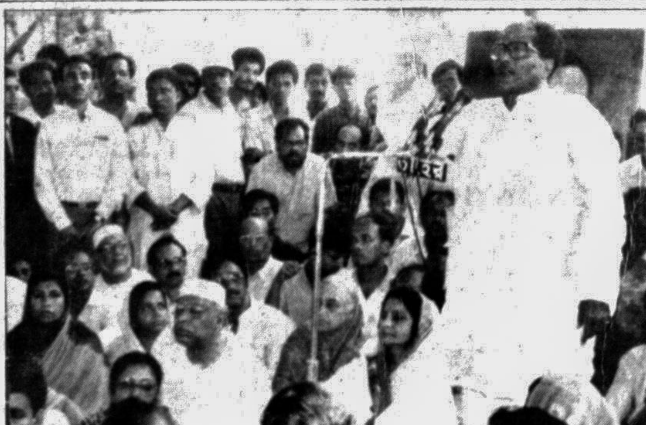
Jatiya Party acting chairman Mizanur Rahman Chowdhury addressing the participants in the 'mass hunger strike' programme of the party in front of the Jatiya Press Club yesterday.