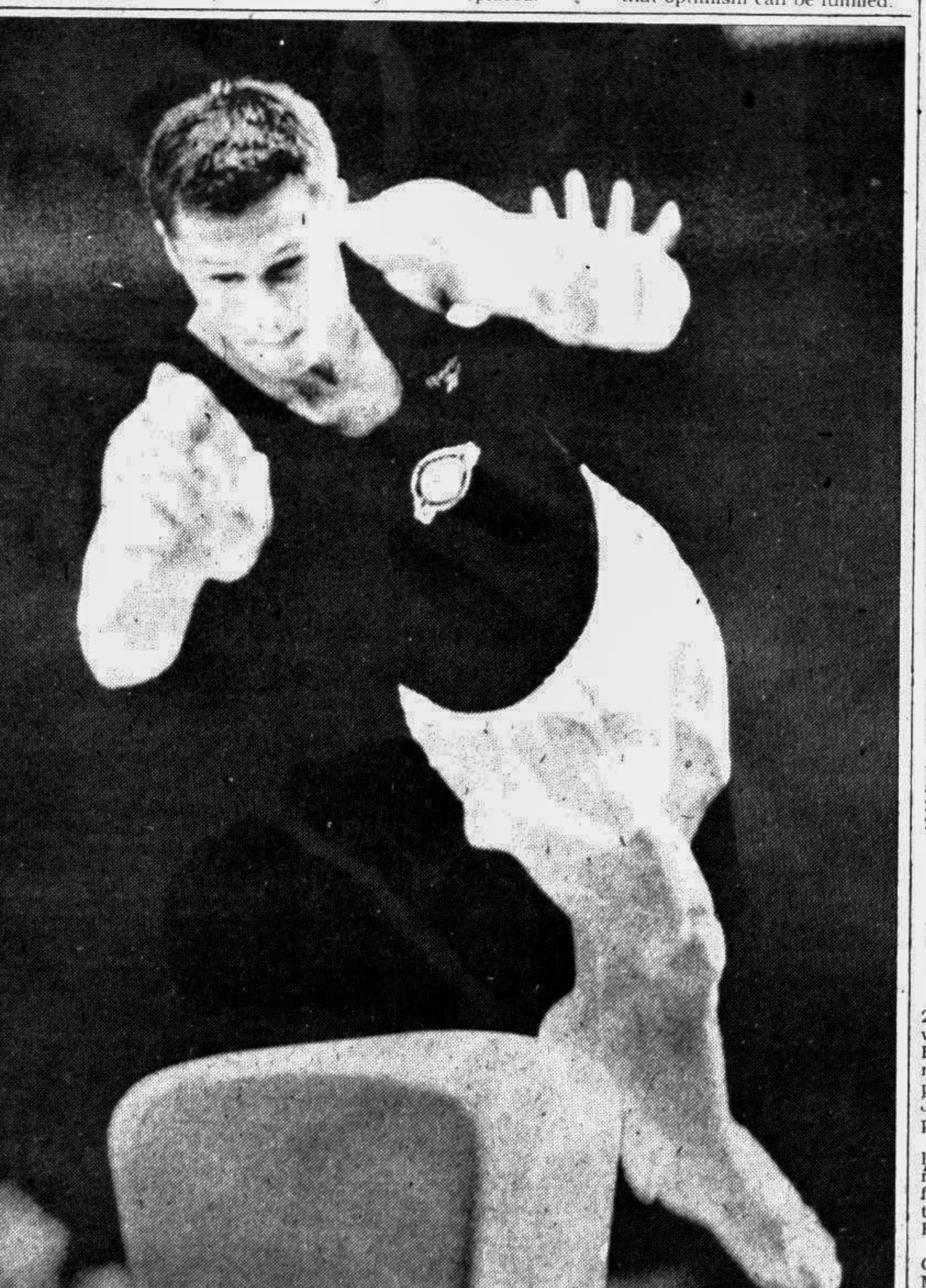
Russia's Alexei Nemov performs on the vault during the finals of the World Championships in San Juan, Puerto Rico on Apr 20. Nemov won the gold in the event scoring 9.756 points.