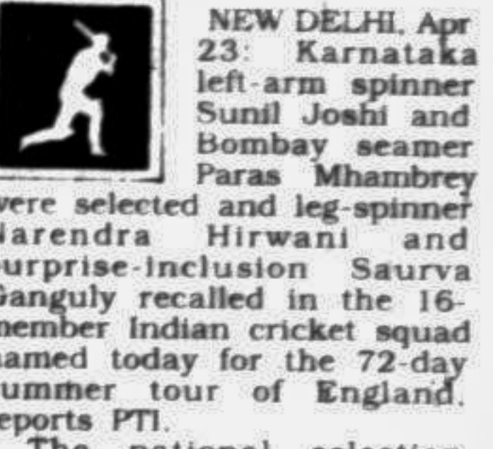
MD AZHARUDDIN ship of Azharuddin, Viswanath said there was no discussion on the captaincy issue. The team, which has 12 from the 14-member side retained, including the entire batting line-up, will have only one wicketkeeper in Nayan Mongia, both Sanjay Manjrekar and Dravid can keep wickets, he said.