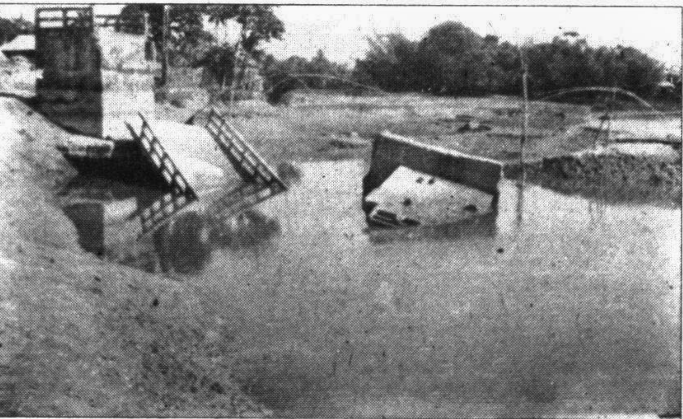
JAMALPUR: The bridge damaged during the last year's flood yet to be reconstructed. At least 65 bridges and culverts that were damaged during the flood, need immediate repair.

Fall of river water level due to the drought mainly caused by Farakka, has also affected the internal navigation routes adversely.