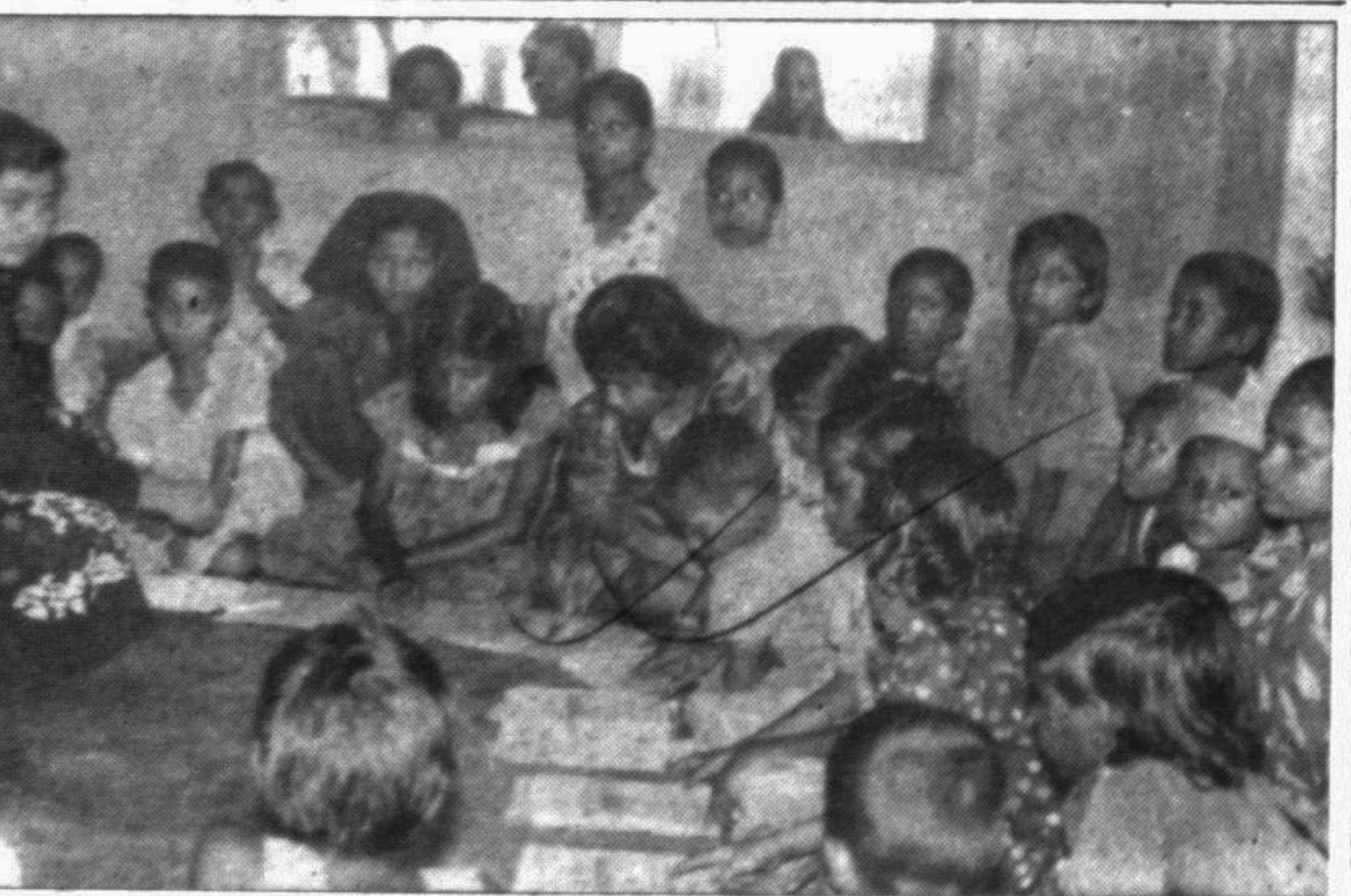
RANGPUR: Children attending a mass education centre in Rangpur organised by the UNESCO Club.