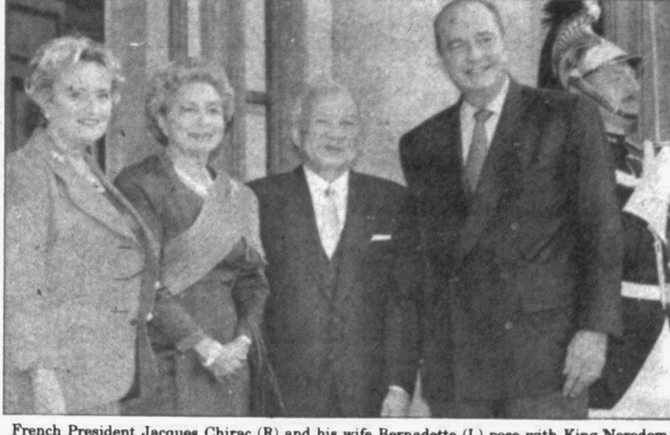
French President Jacques Chirac (R) and his wife Bernadette (L) pose with King Norodom Sihanouk of Cambodia and Queen Monique, at the Elysee Palace on Monday...