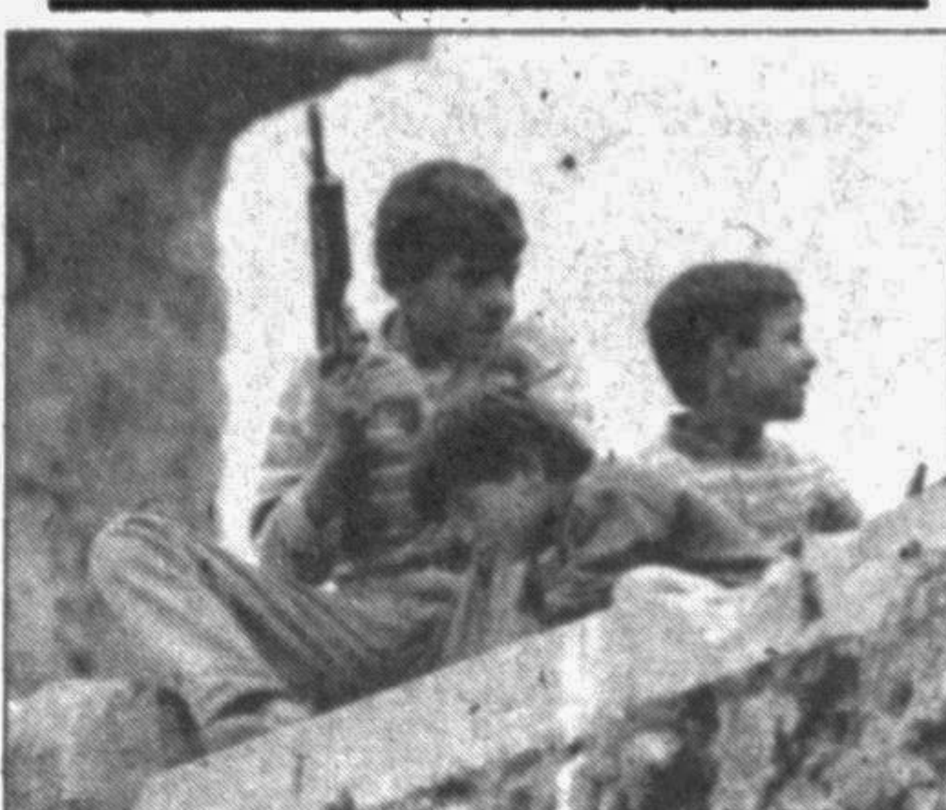
Displaced children from south Lebanon play wargames in Beirut on Monday. Israel stepped up air and artillery attacks in the 12th day of its war on Hezbollah...