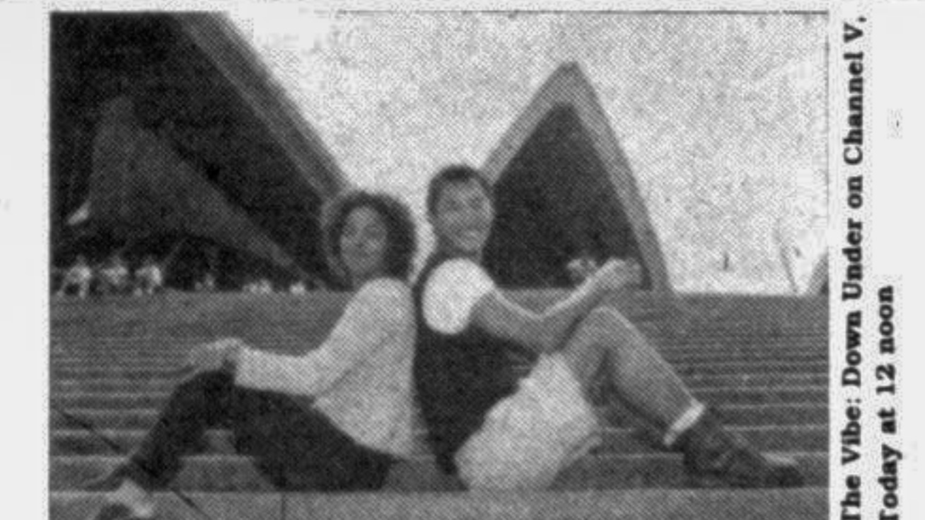
The Vibe: Down Under on Channel V. Today at 12 noon

00:30am Jeetendra Special 01:00 Hit Pairs 02:00 Asha Bhonsle Special 03:00 Ajeab Dastaan 04:00 Chharmendra Special 05:00 Hanste Hanste 06:00 Mohammed Rafi Special 07:00 Geet Bahar 08:00 Anantah Bachchan Special 09:00 Tarane 10:00 R D Burman Special 11:00