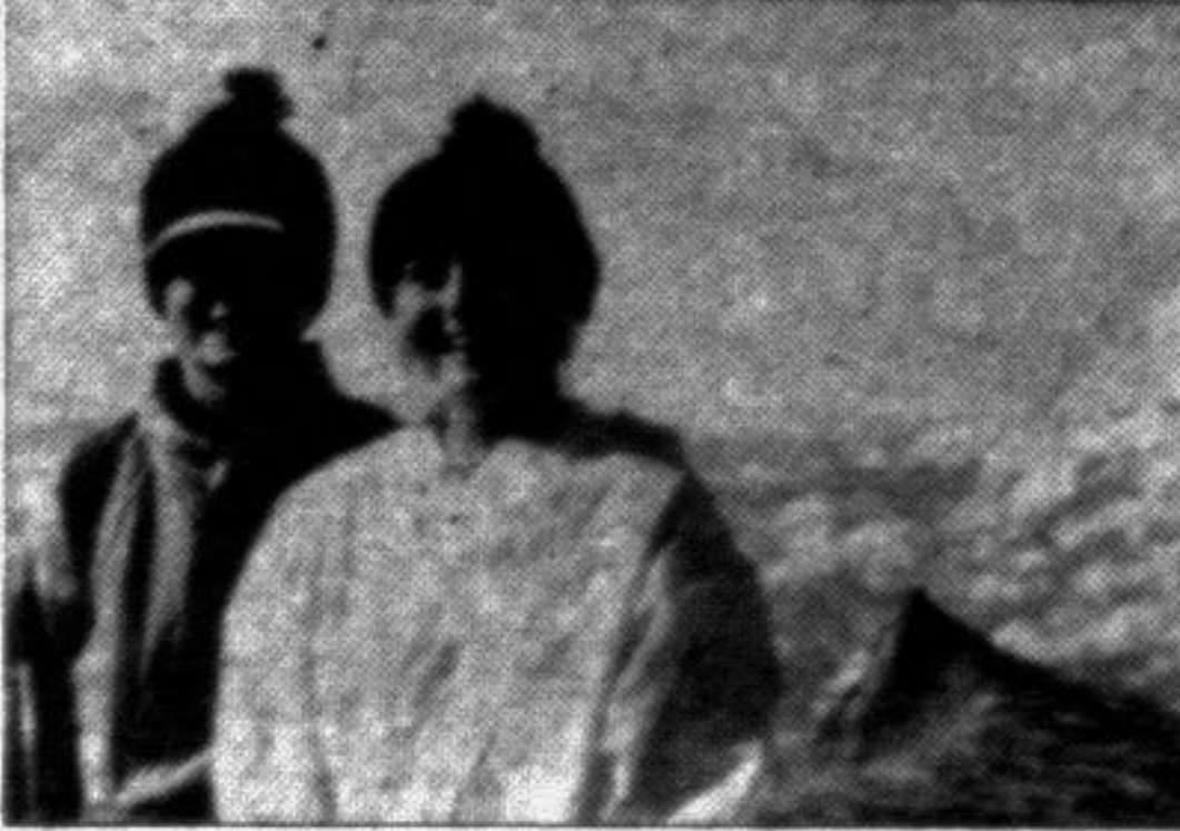
The Big Trip on BBC World, Tonight at 9:05