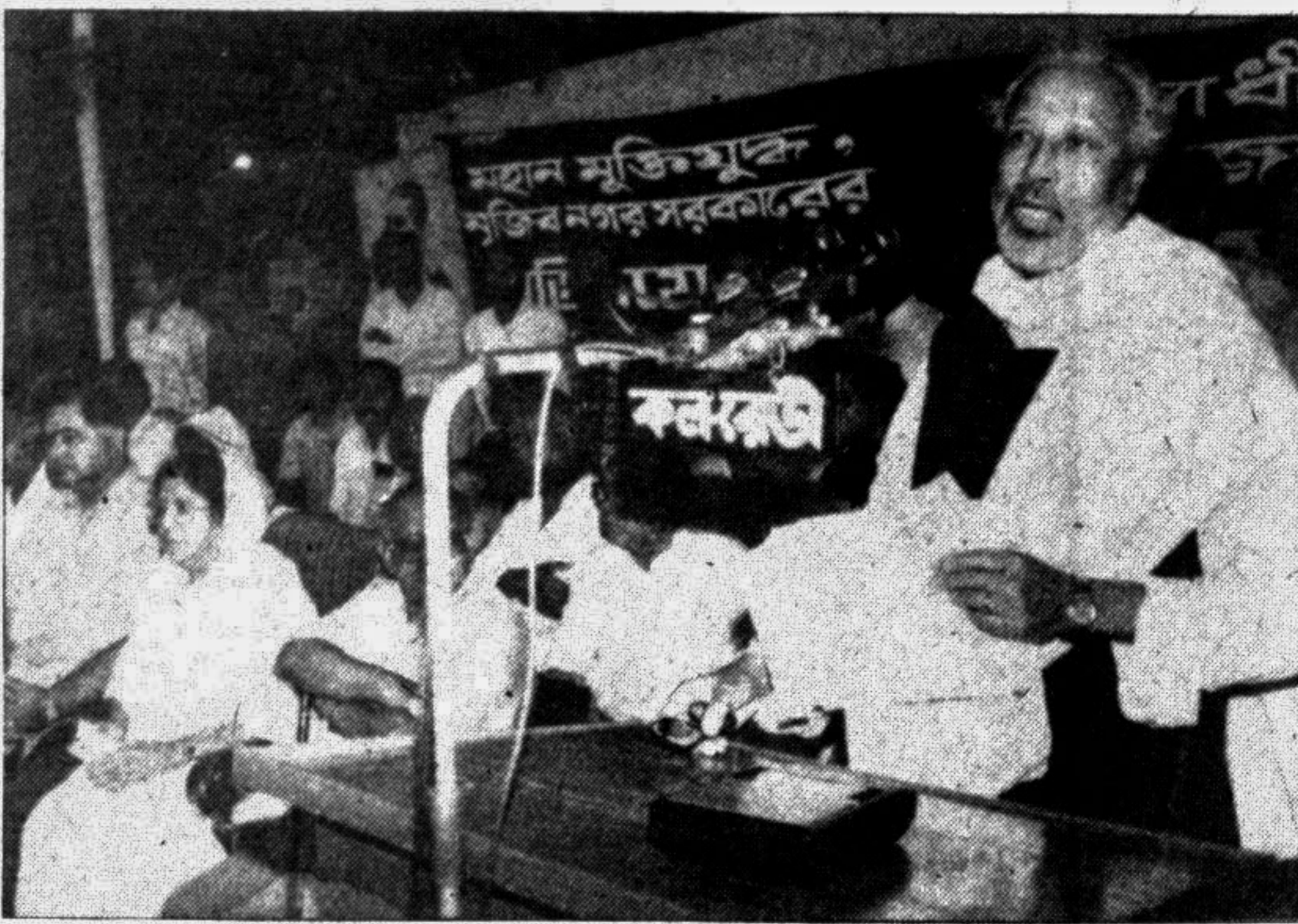
Noted freedom fighter Qader Siddiqui, Bir Uttam, speaking at a function organised to mark the 25-year anniversary of the Mujibnagar government.