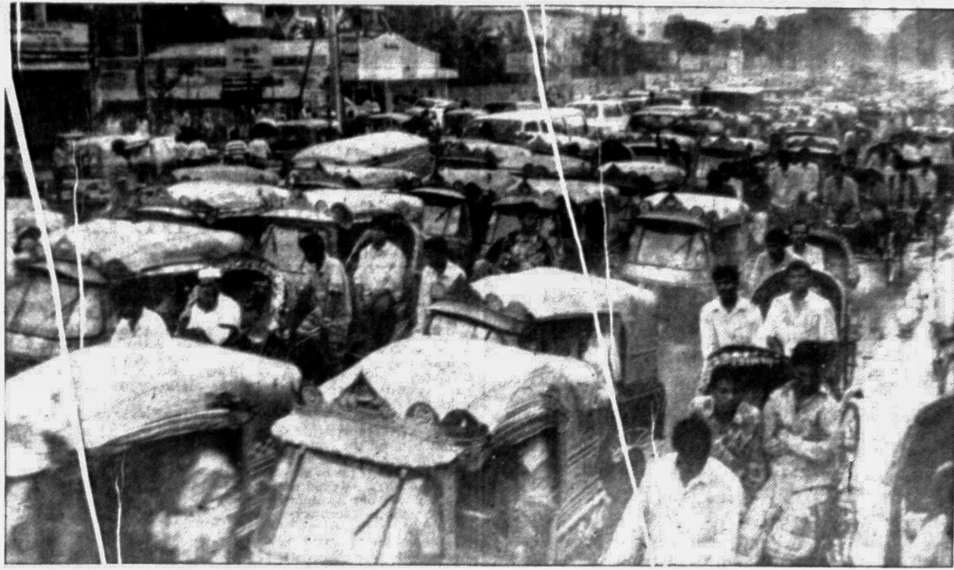
A TINGE OF IRONY! City dwellers experienced an unprecedented traffic congestion on the third day, yesterday, of Traffic Week.