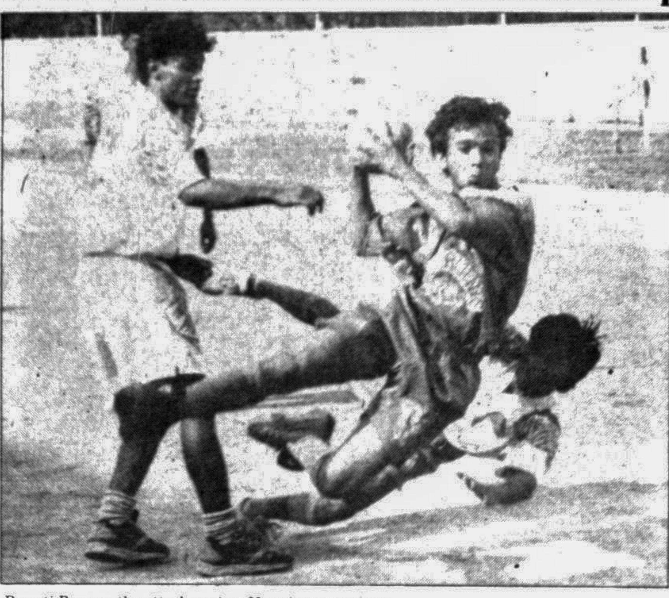
Progoti Boys on the attack against Nawabpur Sporting.

In another Group E encounter at the Dhanmondi Cricket Stadium, Maple Leaf International School defeated