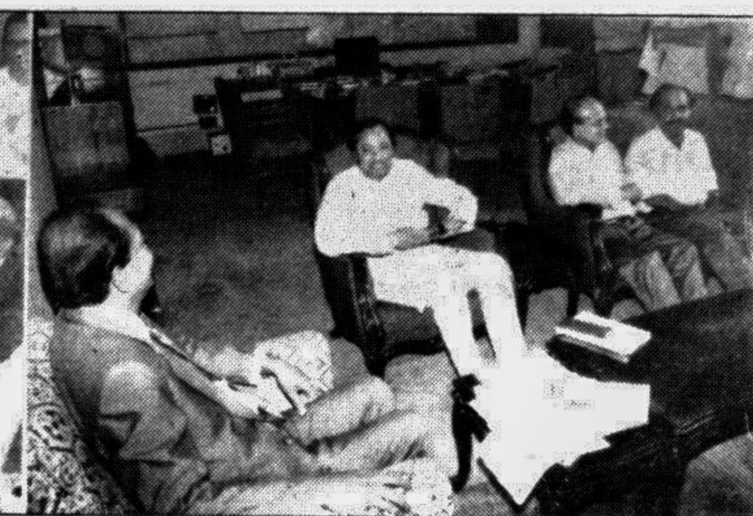
(L-R) leaders of BNP, Awami League and Jatiya Party.