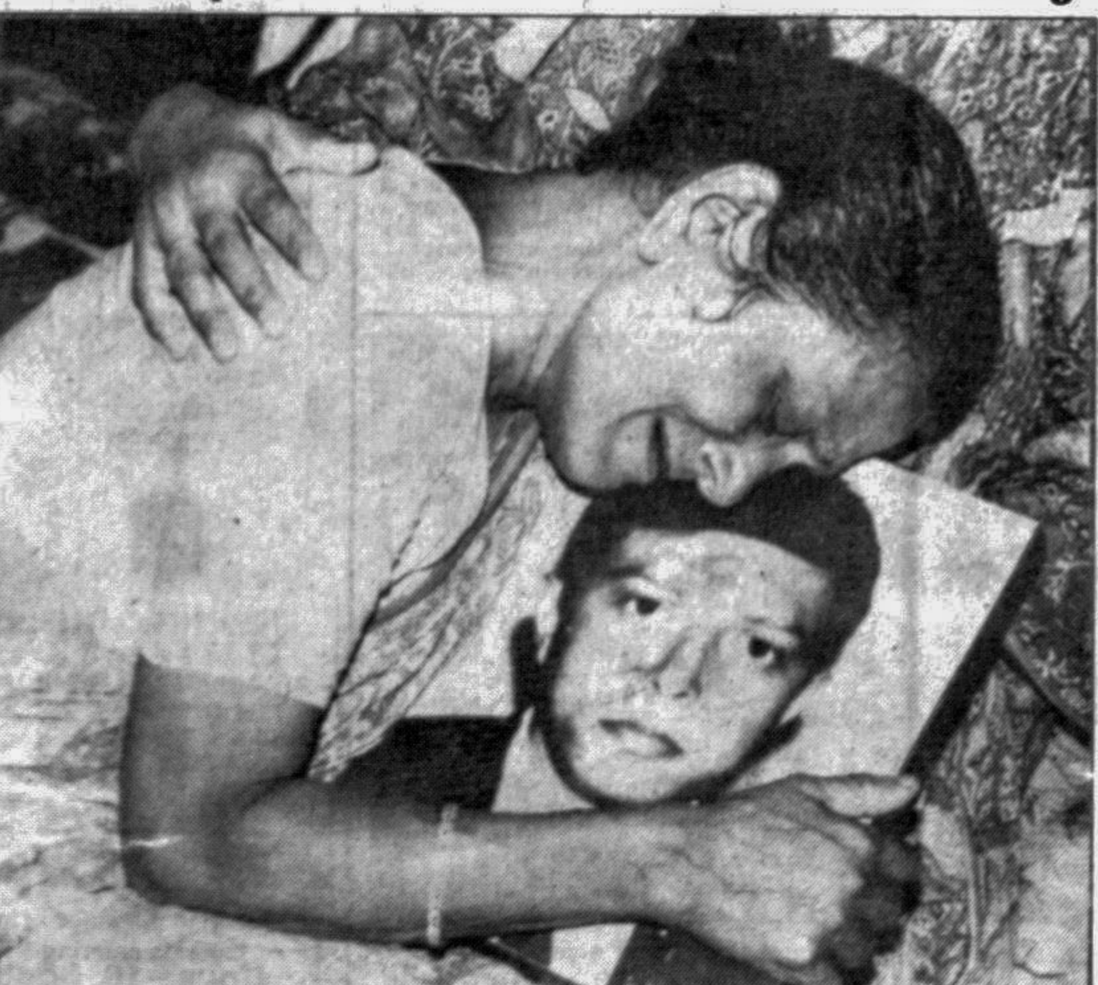
Mother of Jamal breaks down holding a photograph of her son at her residence in the city yesterday.