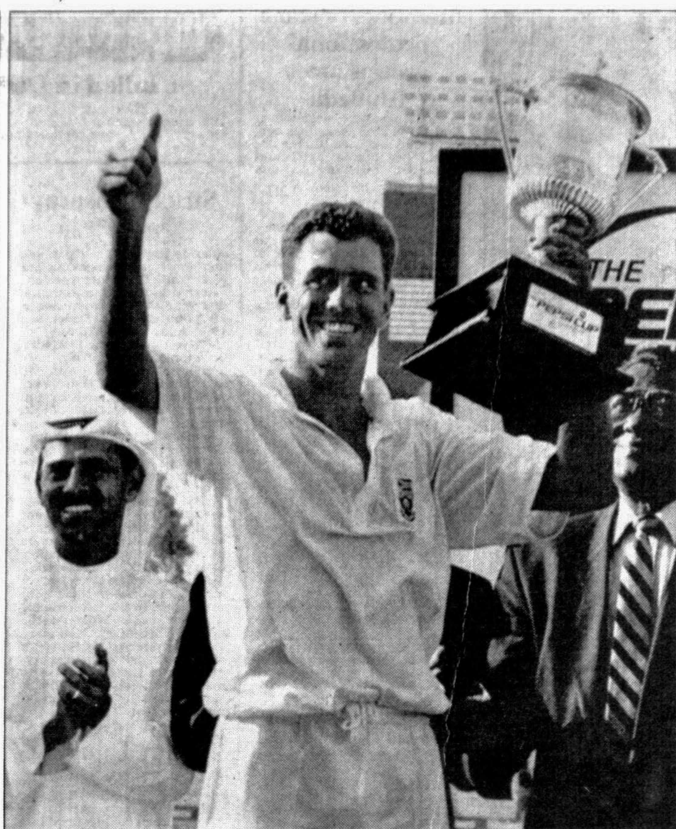
Victorious South African skipper Hansie Cronje poses with the Pepsi Cup after the final in Sharjah, United Arab Emirates on April 19. South Africa beat India by 38 runs.

The full marathon distance of 42.195 kilometres marathon track was attempted by 257 runners from 35 countries, while 1,740 others from 14 countries participated in the half marathon.