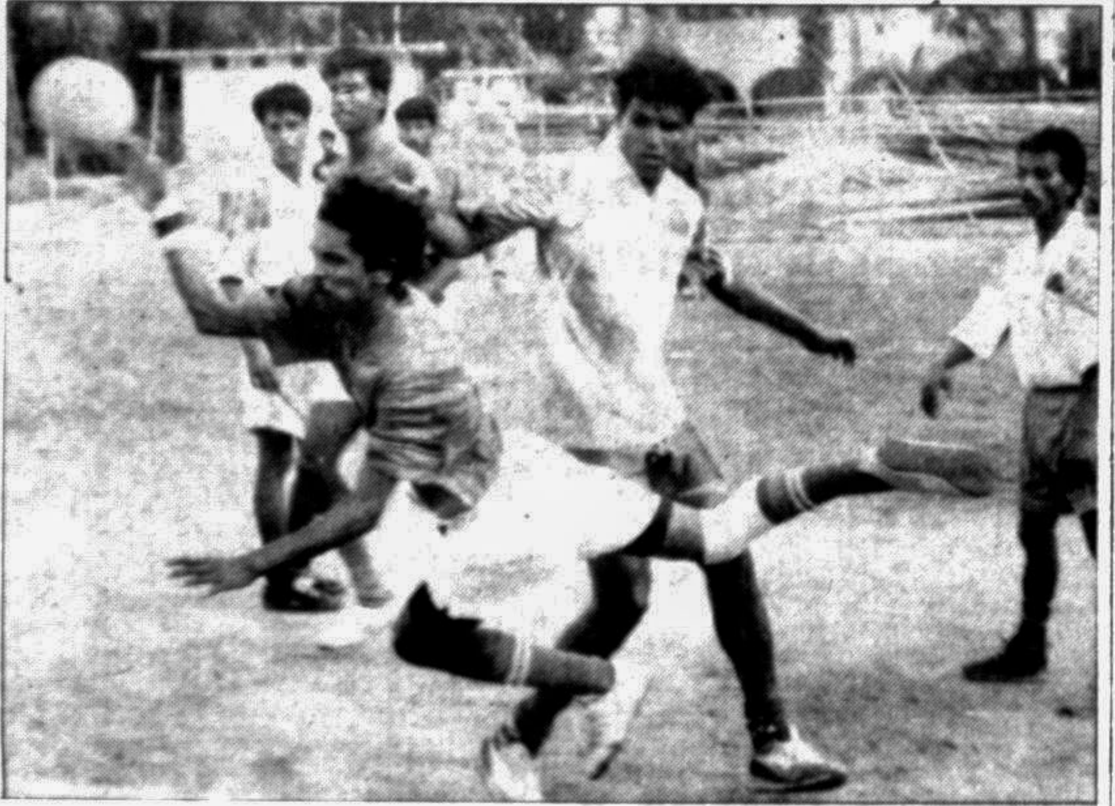
Action from yesterday's Ashraf Real Estate First Division handball league encounter between Christian Youth Club and Nawabpur Sporting Club at the Dhaka Stadium handball court which the former won 27-9.