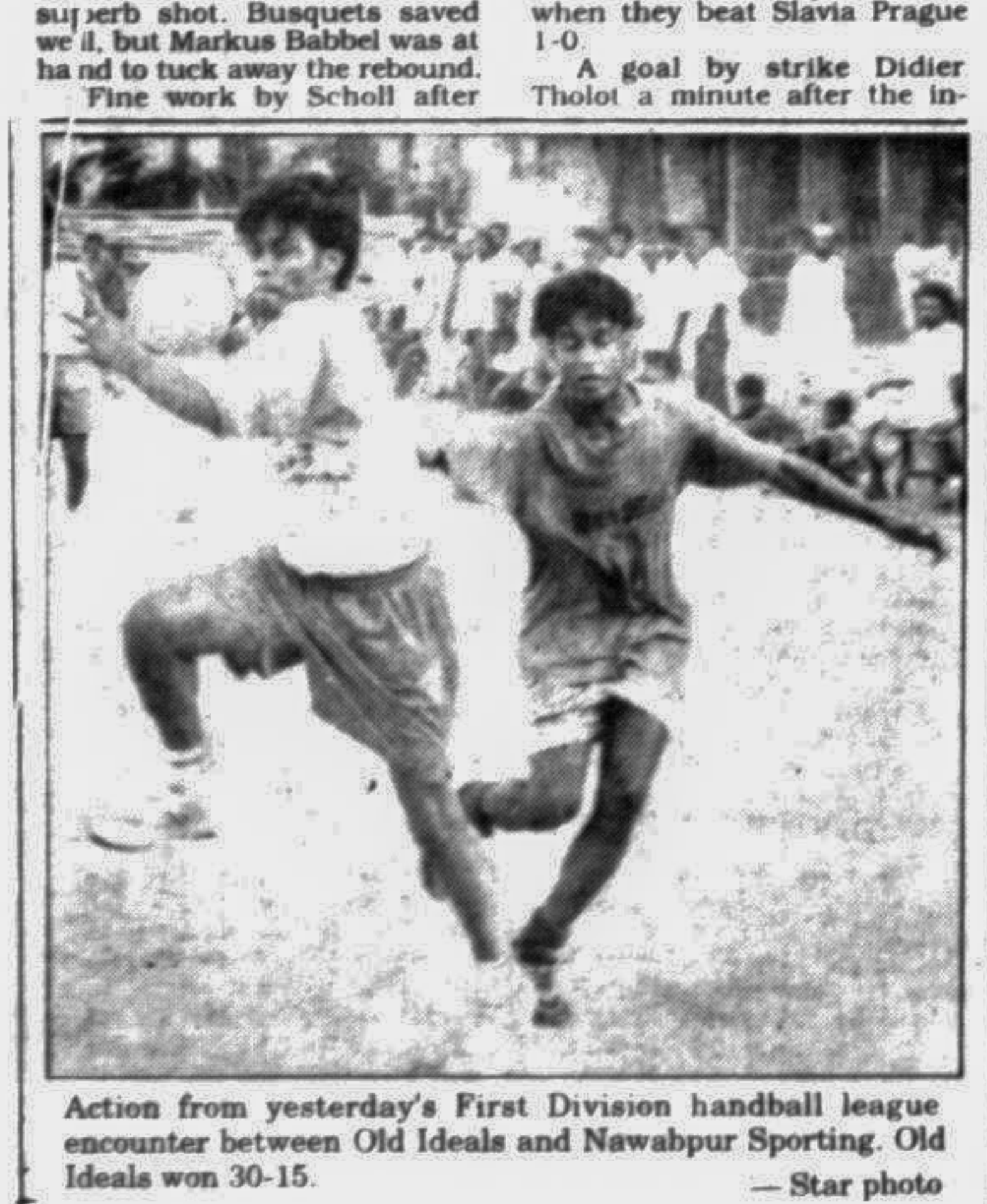
Action from yesterday's First Division handball league encounter between Old Ideals and Nawabpur Sporting. Old Ideals won 30-15.