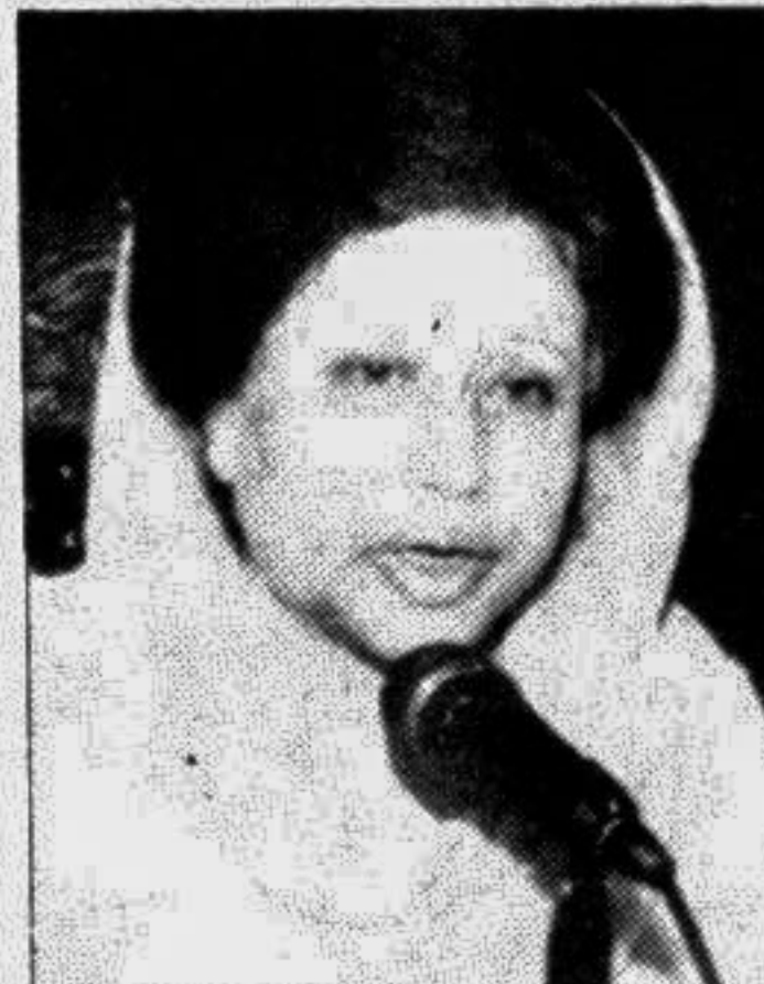
Khaleda addressing BNP EC meeting

BNP Chairperson Begum Khaleda Zia has instructed her party men across the country to adopt pragmatic political tactics, sink differences, maintain discipline and forge total unity in the party to ensure its victory in the coming general elections.