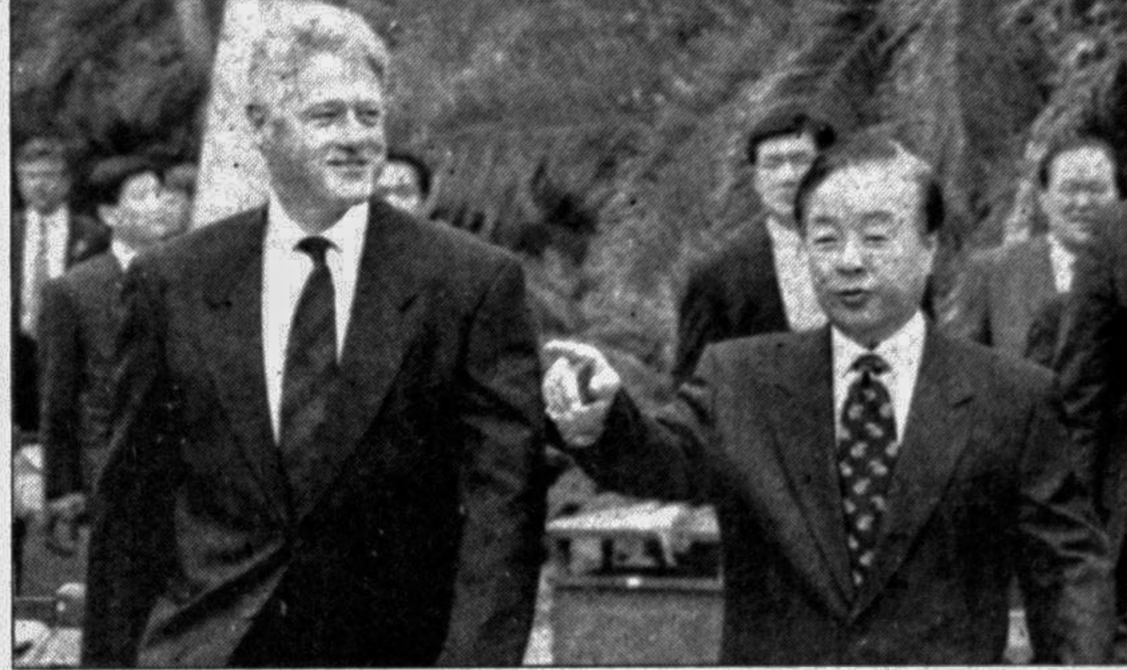
US President Bill Clinton (L) takes a walk with his counterpart Kim Young-Sam in the garden of Hotel Shilla on Cheju Island on Tuesday before their summit meeting.

CHEJU ISLAND, South Korea, Apr 16: US President Bill Clinton and South Korean President Kim Young-Sam today called upon North Korea and China to join in talks designed to bring a permanent peace to the Korean peninsula, reports Reuter.