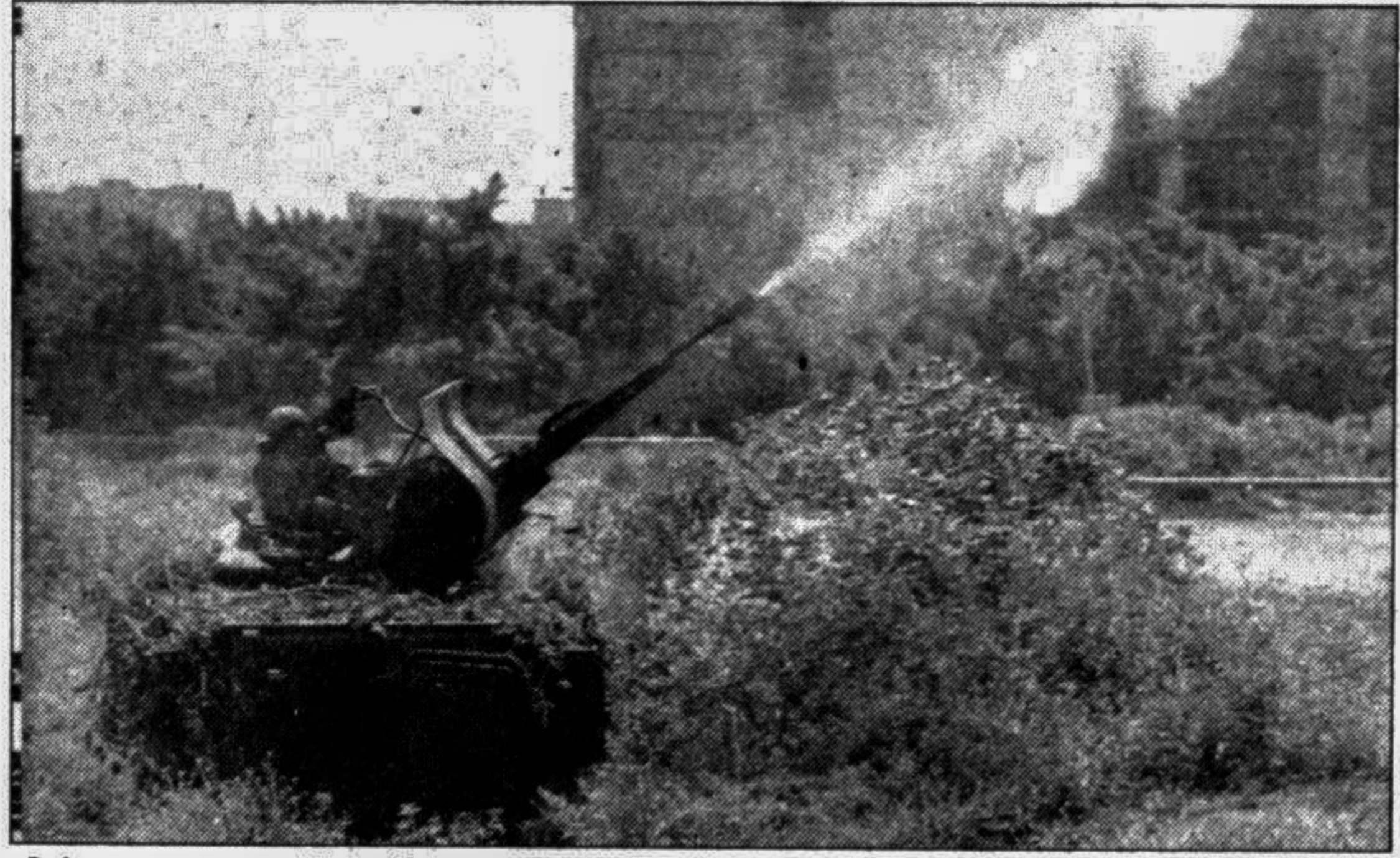
Lebanese army soldiers fire an anti-aircraft heavy machinegun at Israeli jets flying over Beirut on Monday. The Iranian-backed Hezbollah said it would stop firing rockets on northern Israel if the Jewish state halted its five-day offensive in Lebanon.

ISLAMABAD, Apr 16: After several weeks of uncertainty, the United States has announced the delivery of a frozen shipment of military material to Pakistan, spelling a diplomatic coup for Prime Minister Benazir Bhutto, who has long been courting Washington, reports AFP.