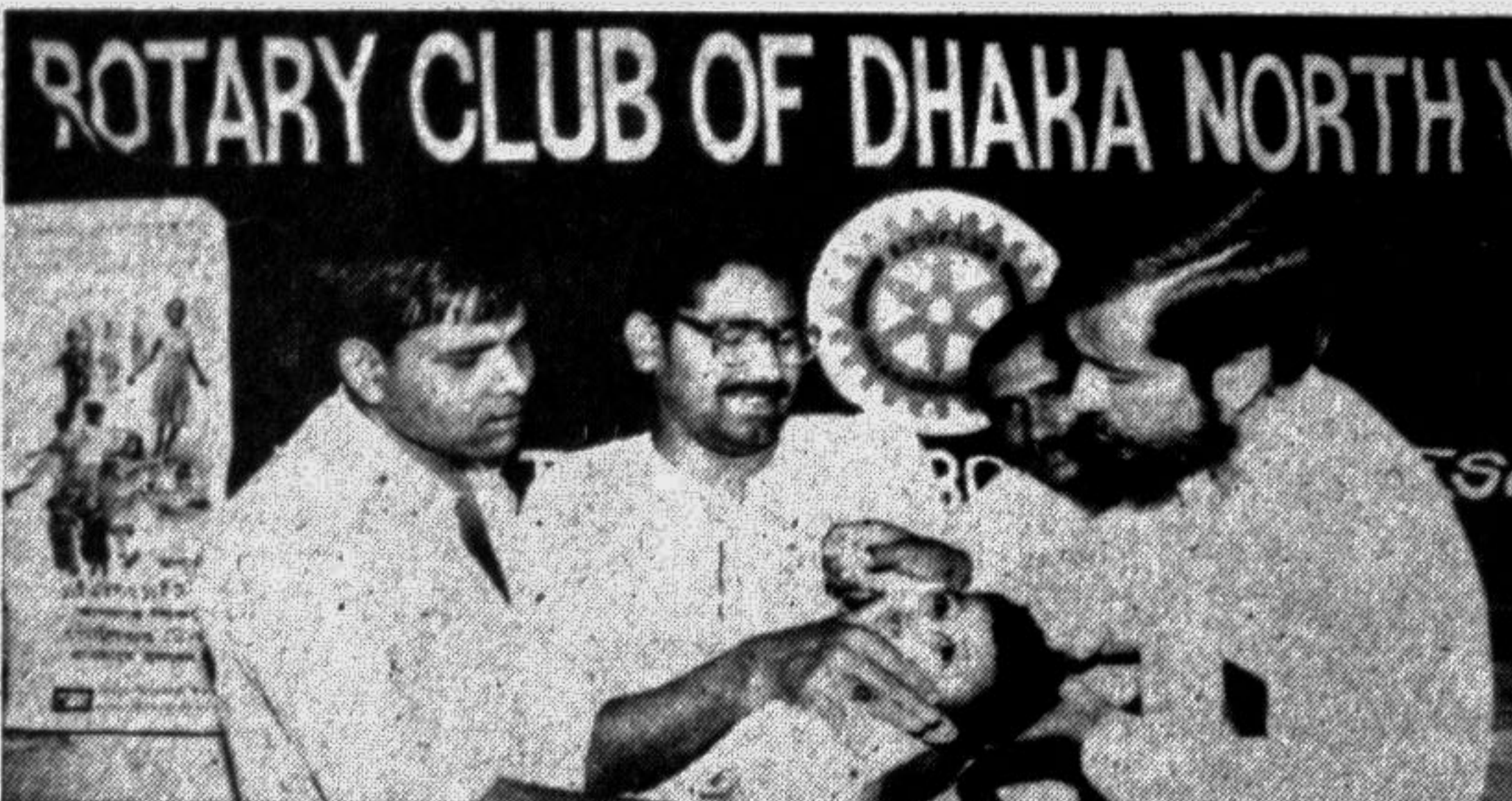
Rotary Club of Dhaka North West organised a polio vaccination programme on the occasion of the National Immunisation Day in the city yesterday.

Ten of the arrested were wanted criminals. Legal actions were taken against all of them.