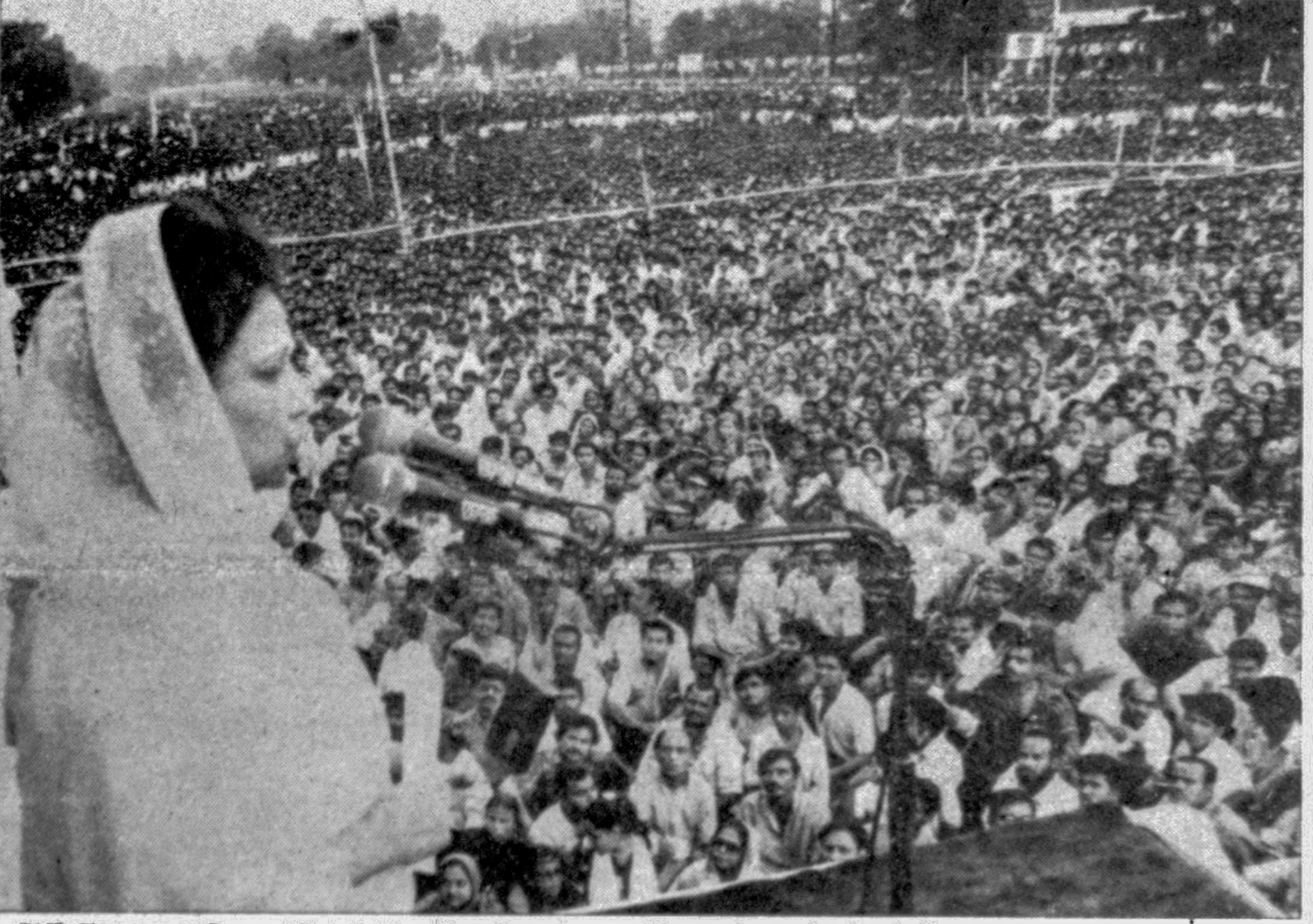
BNP Chairperson Begum Khaleda Zia addressing a huge public meeting at the Manik Mia Avenue in the city yesterday.