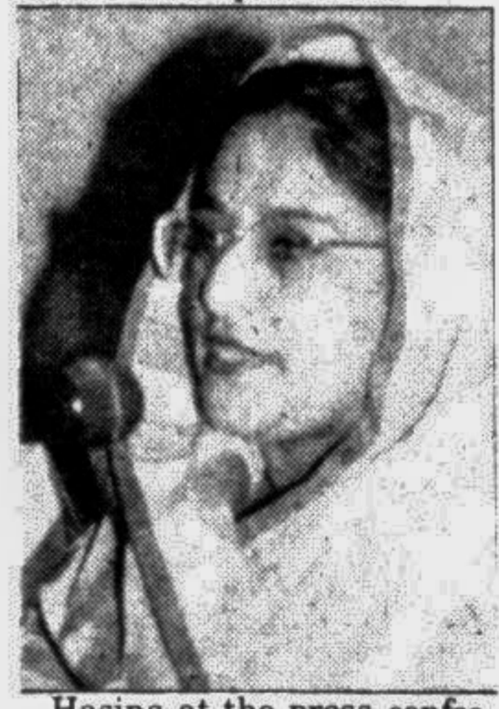
Hasina at the press confce