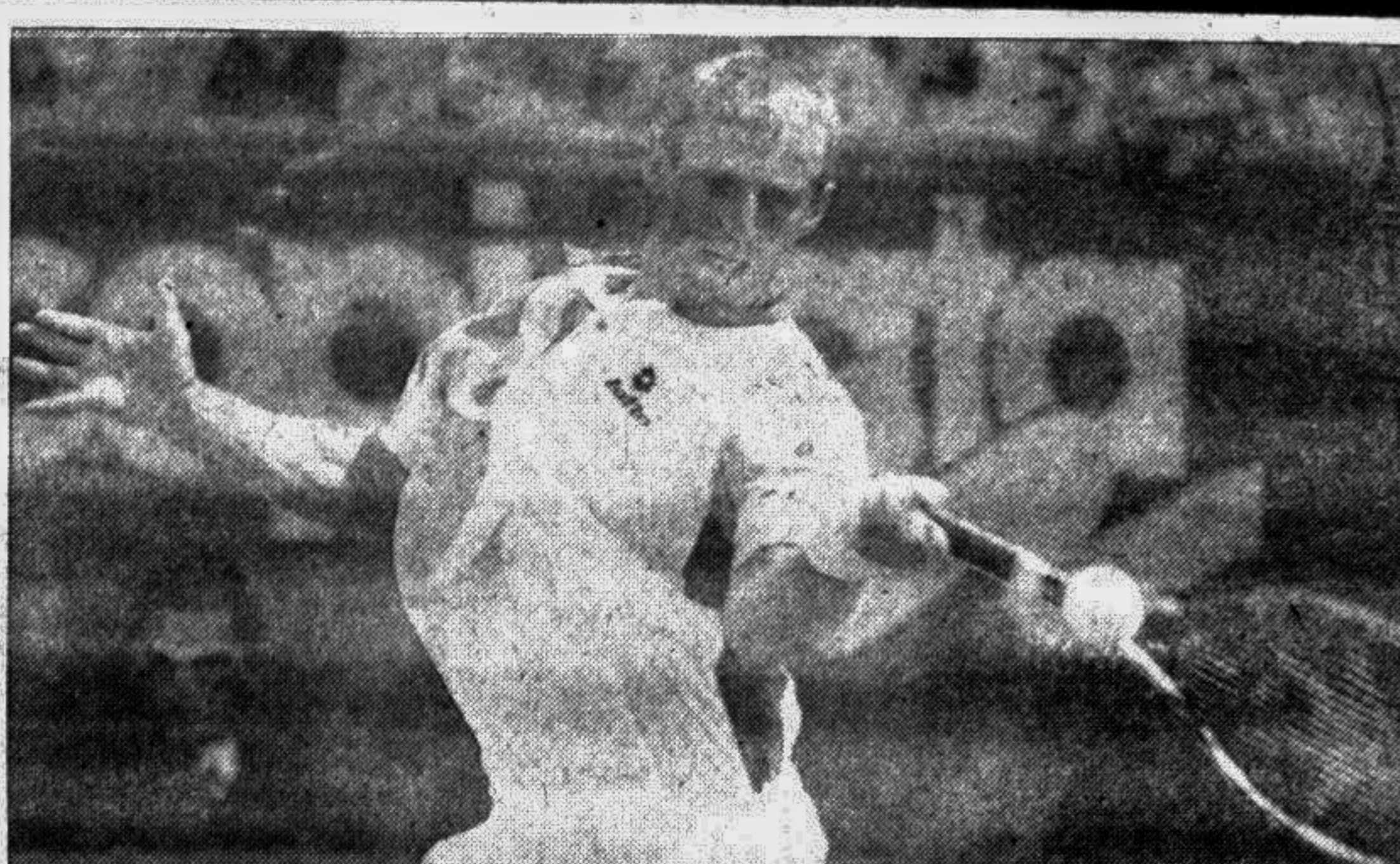
Thomas Muster of Austria plays a forehand return against Andea Gaudenzi of Italy during their final match of the Estoril Open in Lisbon on April 14. Muster won 7-6 (7-4), 6-4.

In another final preliminary match in Seoul, China beat Australia 15-9, 15-10, 15-11 for their first win against two losses. Australia have three losses.