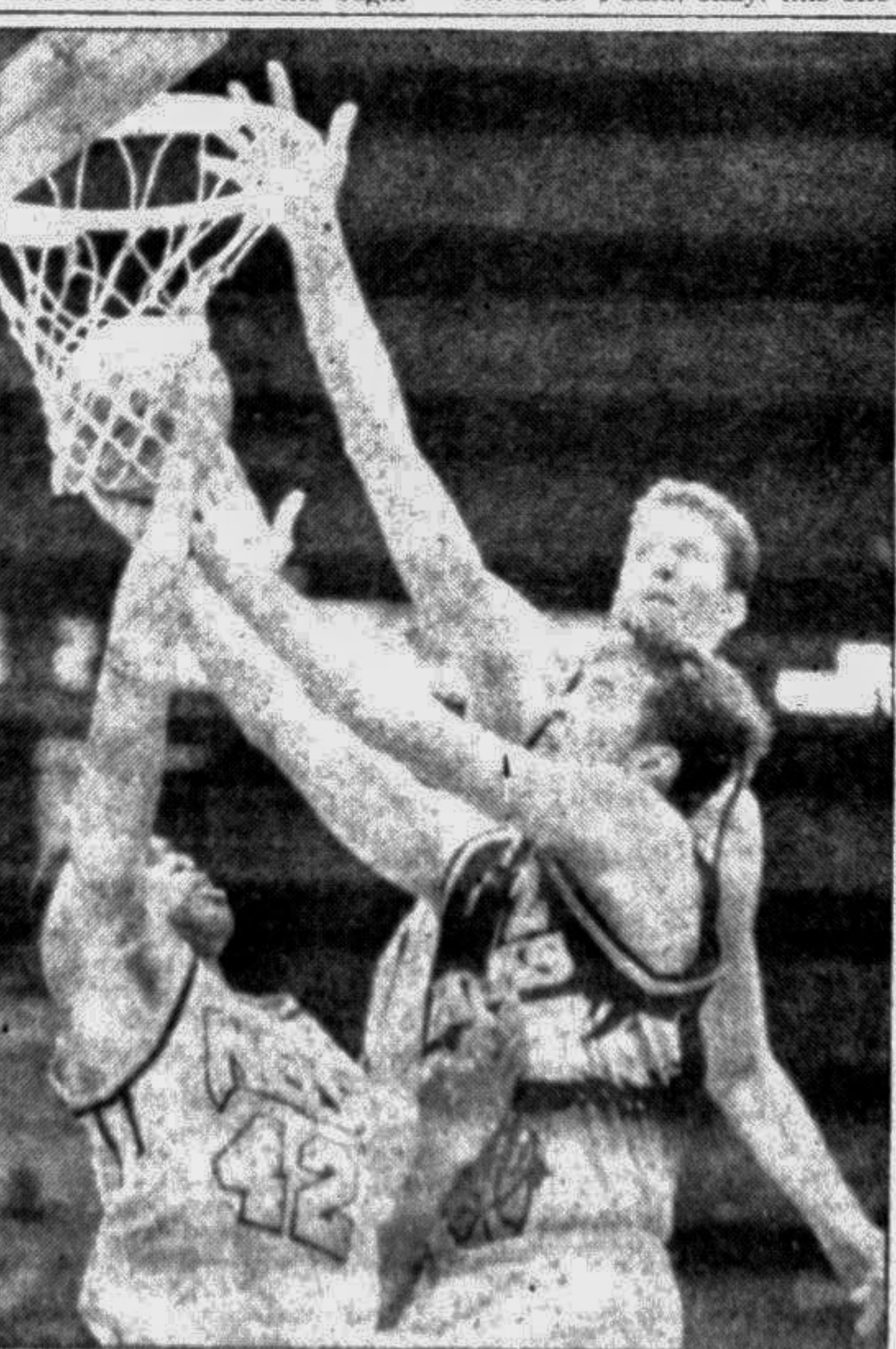
Christian Laettner (C) of Atlanta Hawks tries to score under challenge from two New Jersey Nets defenders during an NBA fixture in East Rutherford NJ on April 14. The Hawks won 99-90.

Fourteenth seed Bernd Karbacher became the first ranked player to fall, losing to fellow German Hendrik Dreckmann 2-6, 4-6, while 16th seed Tim Henman of Britain went down to American Jeff Tarango 1-6, 4-6.