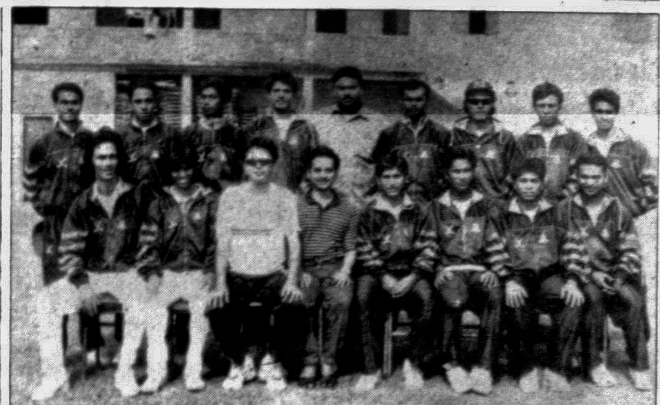
Surjo Tarun Club emerged champions of the Yamaha First Division cricket league. They along with runners-up Lalmatia Club will feature in the Premier Division next season.