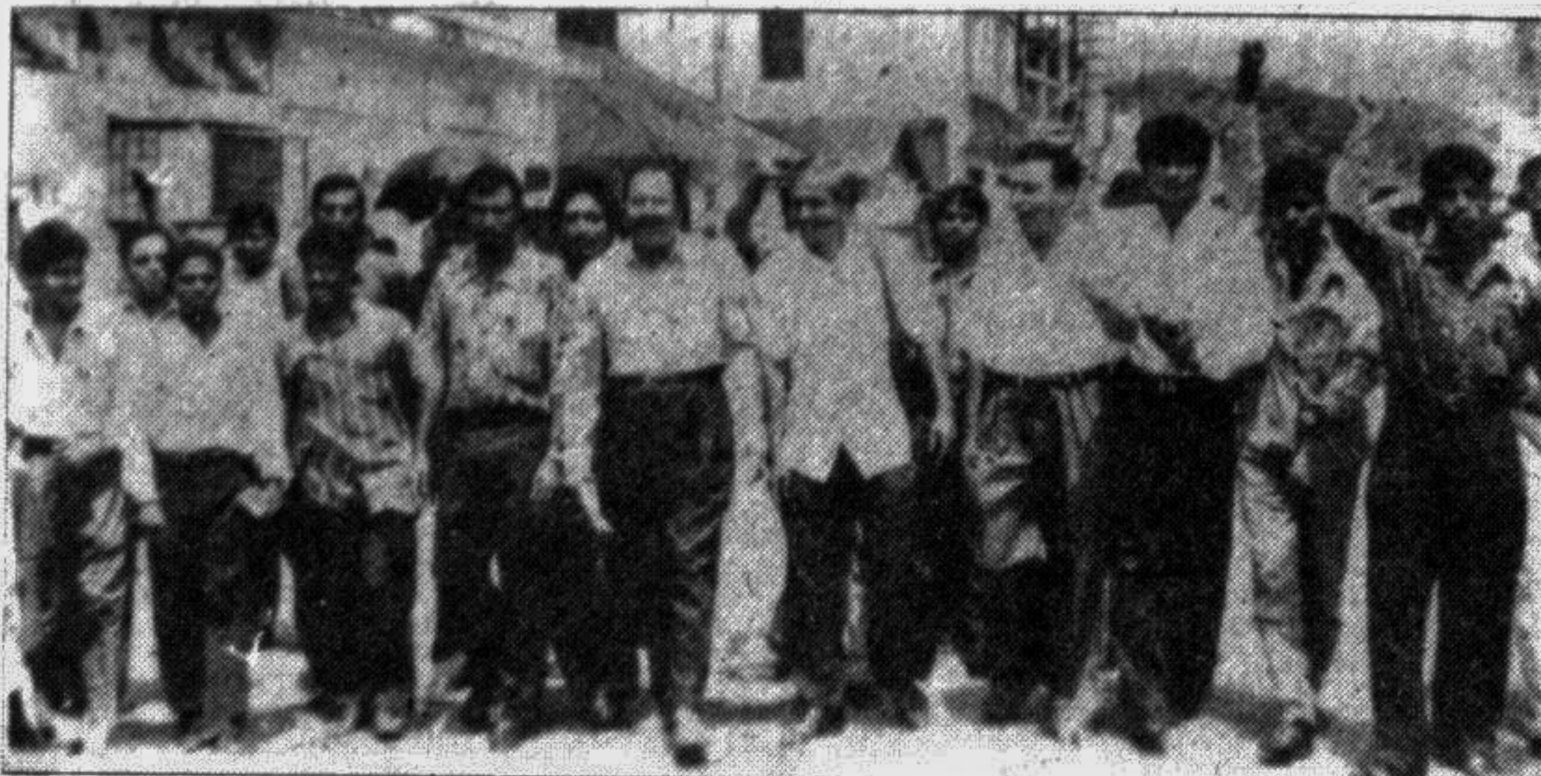
SYLHET: A procession was brought out in the town on Thursday demanding additional flights in Sylhet-Dhaka route for non-ballottee Haj pilgrims from Sylhet.