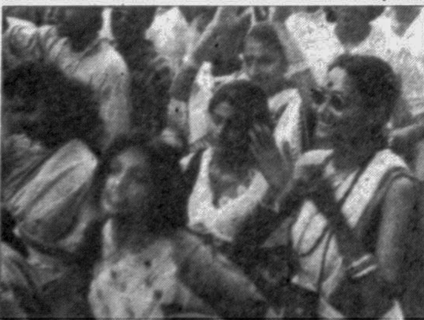
Noted model Bibi Russel at a rally in the city.