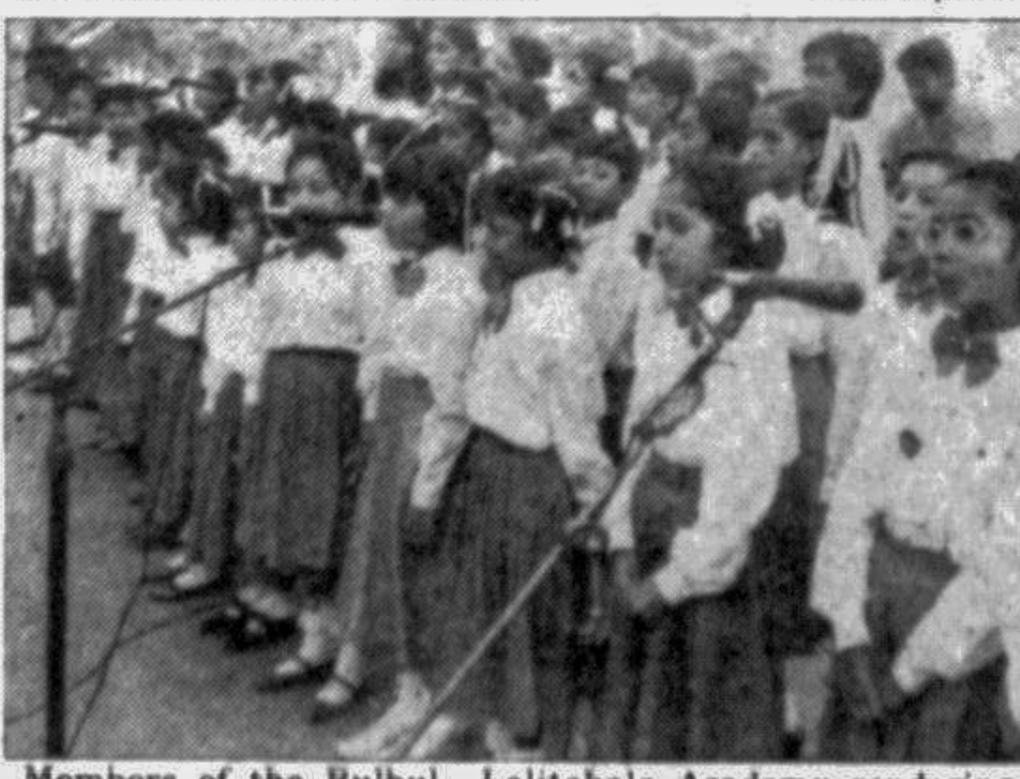
Members of the Bulbul Lalitakala Academy rendering songs beside the Dhanmondi Lake.