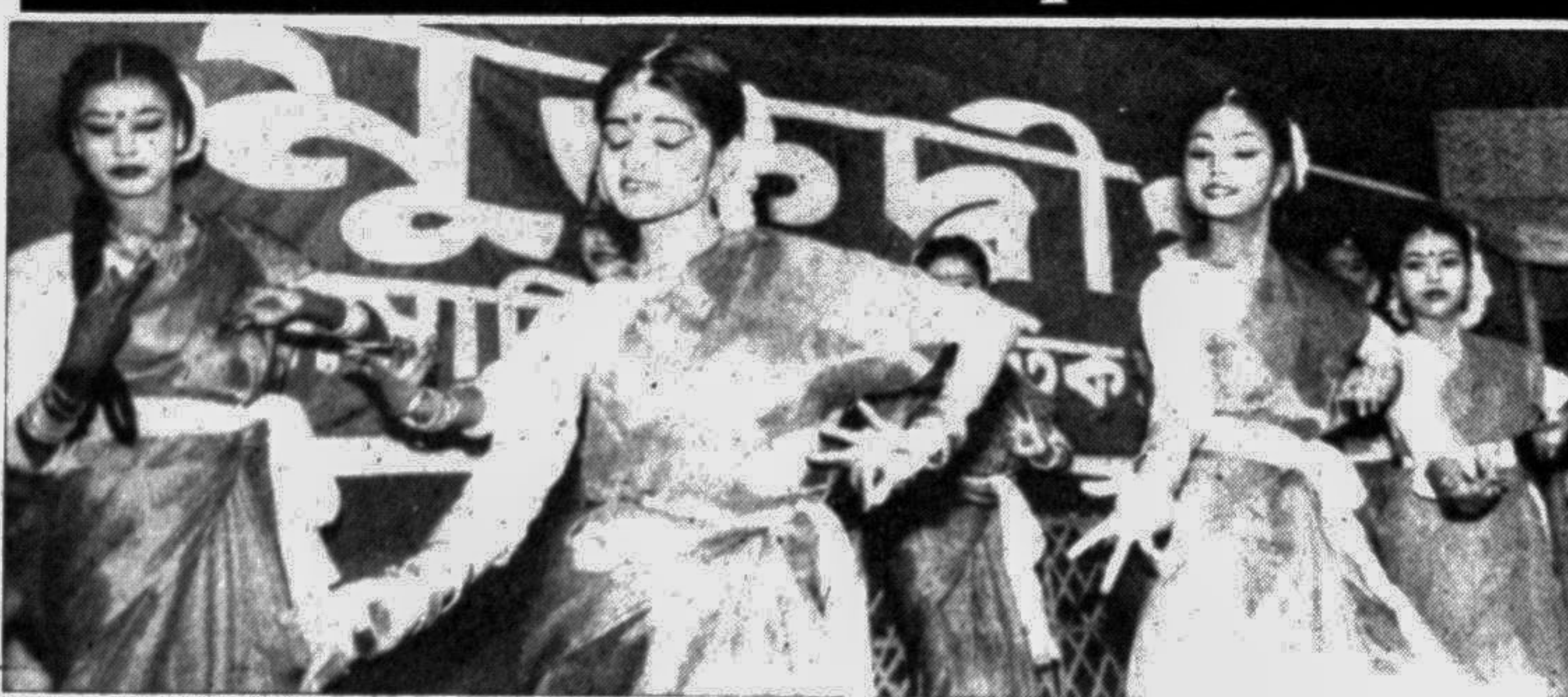
Members of the Mukta Dip Samajik Sangskritik Sangathan performing dances in front of the Jatiya Press Club Sunday.