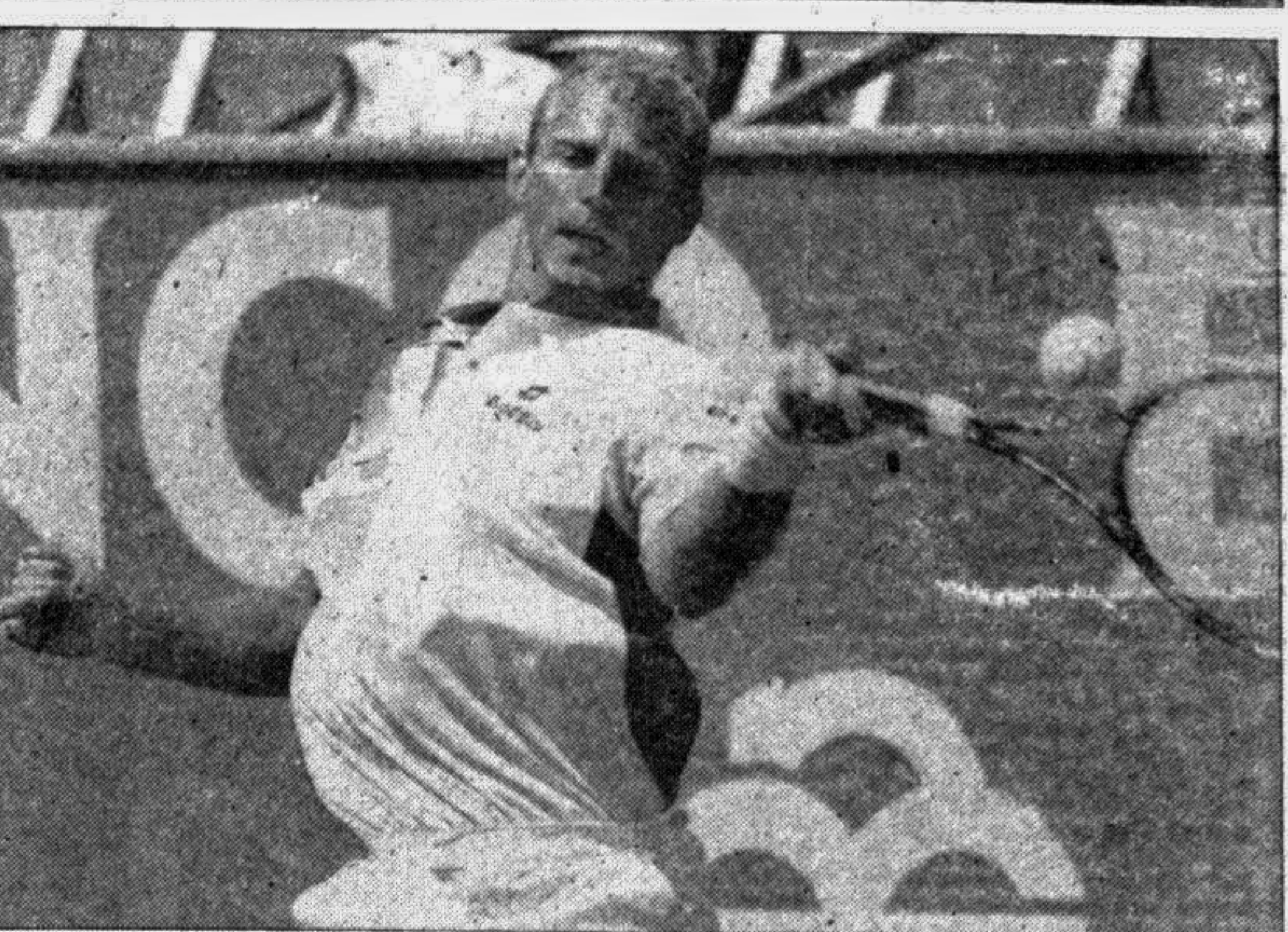
Thomas Muster, the world No 1, executes a forehand during his match against Spanish youngster Carlos Moya at the Estoril Open in Lisbon, Portugal on April 11. Muster won 6-4, 6-2.

The intelligent transportation systems operation is designed to update information about traffic flow on inter-state highways and other major thoroughfares through a network of sensors and video cameras. Forty-one programmable electronic signs are to go into operation over the three 12-lane inter-state highways that encircle the Atlanta area. Eight signs already are operable. The system also includes 12 low-power radio units that broadcast traffic updates on the 530 am radio frequency.