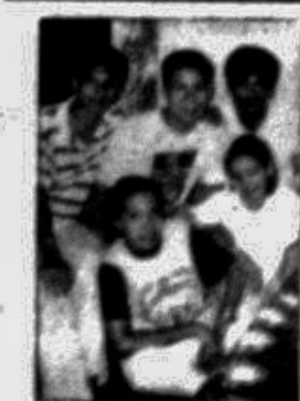
Visitors in Troubled Times