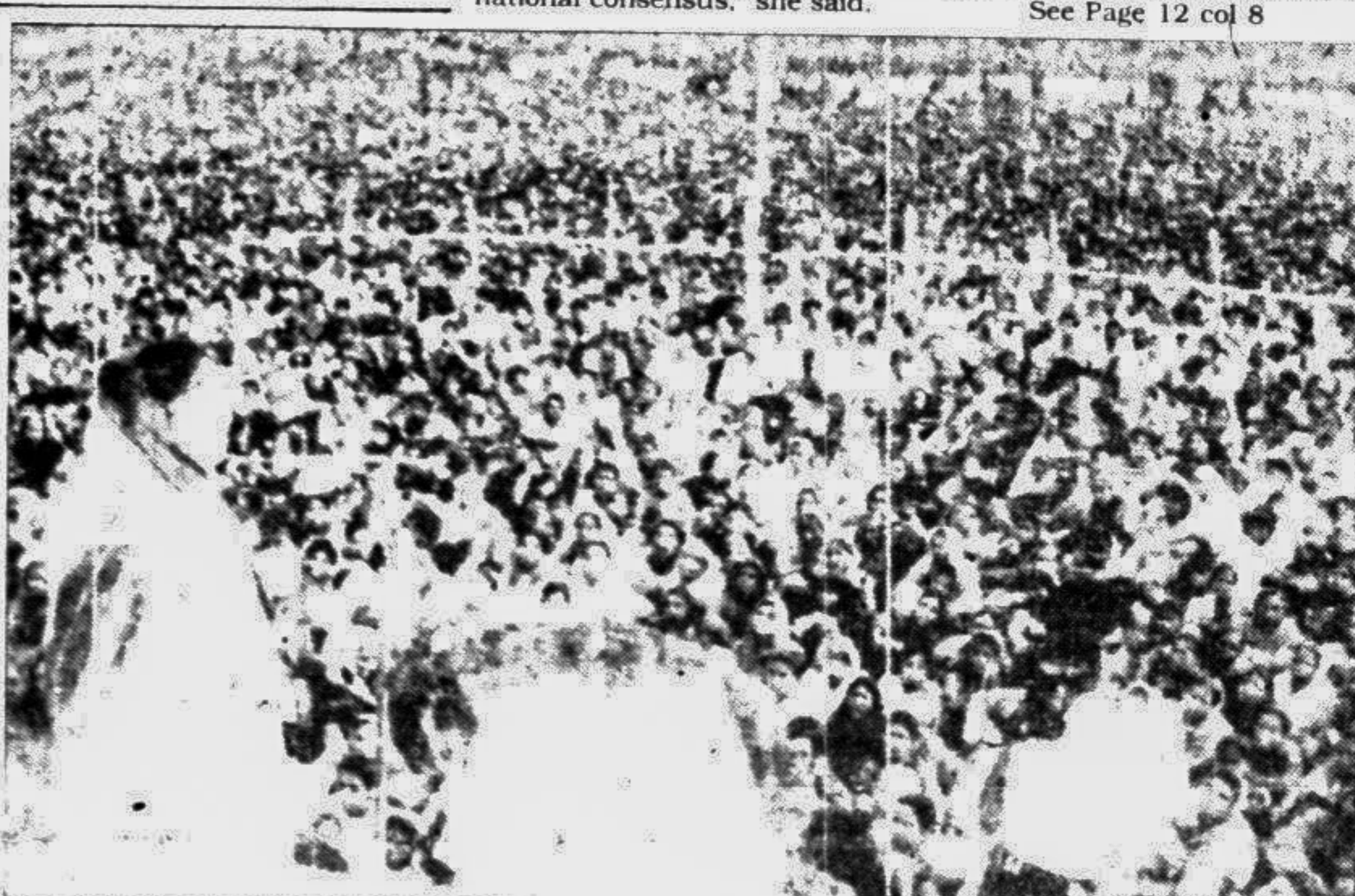
Awami League President Sheikh Hasina addressing a huge public meeting at the Khulna Circuit House maidan yesterday.