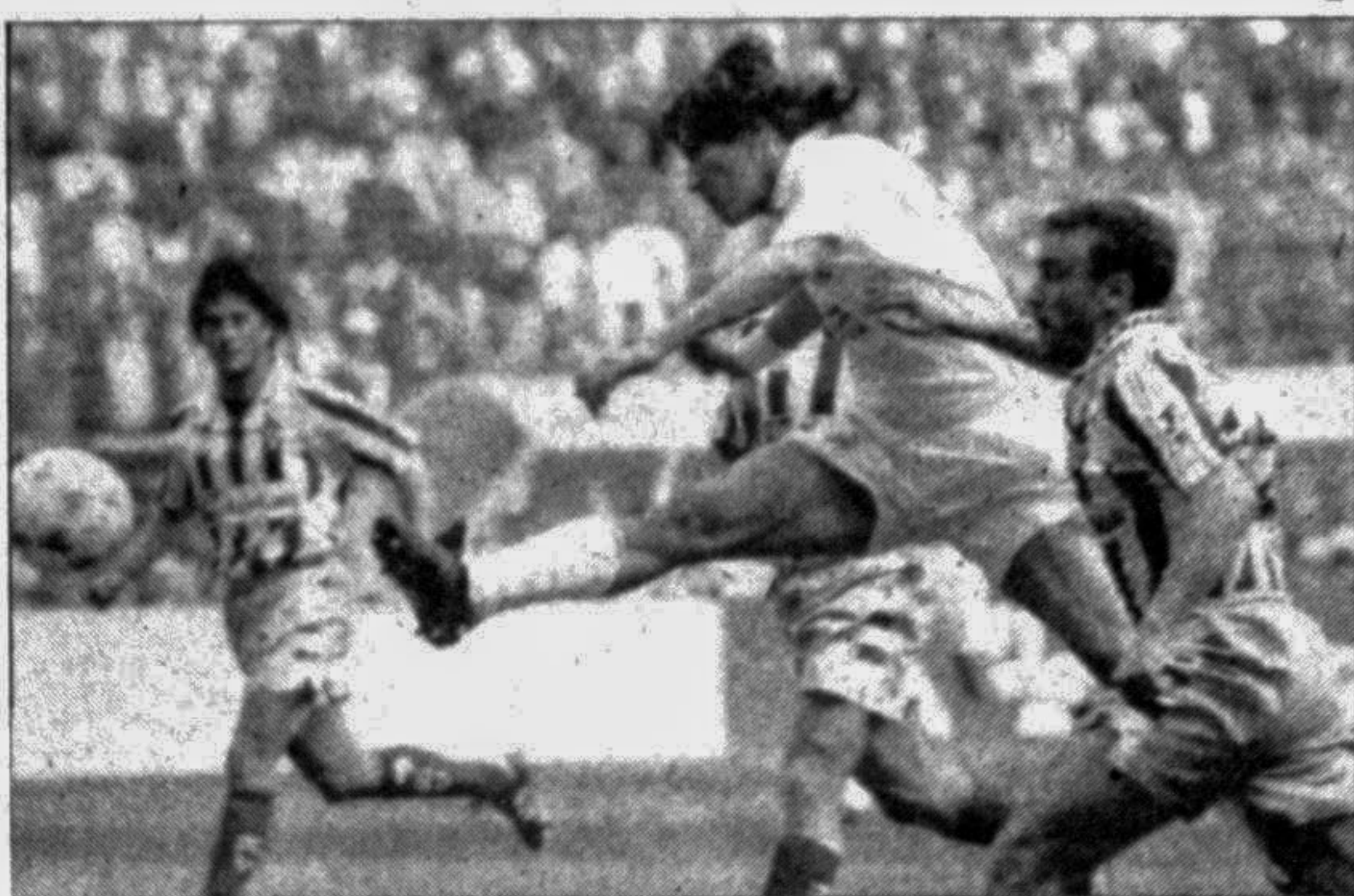
Real Madrid's ace marksman Ivan Zamorano volleys towards the Sporting Gijon goal during a Spanish league encounter in Madrid on Apr 7. Gijon won 1-0.

Other second-round pairings include Dominican Republic-Netherlands Antilles, Cayman Islands-Cuba, St. Kitts and Nevis-St. Lucia, Puerto Rico-St.