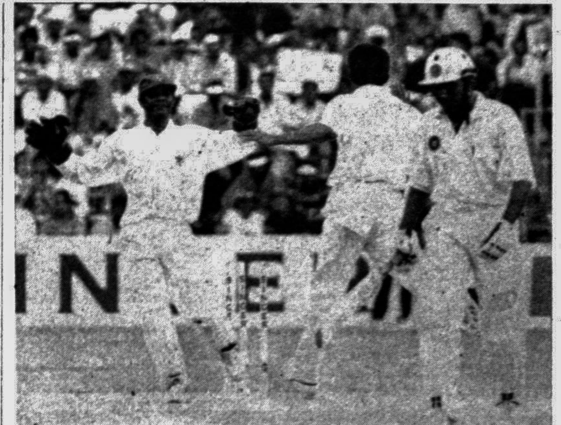
A dejected Indian batsman Sanjay Manjrekar (R) walks back thinking he is run out while Pakistani wicketkeeper Rasheed Latif (L) and Saqlain Mushtaq celebrate the dismissal during yesterday's Singer Cup tie in Singapore. The umpires however ruled Manjrekar's partner Ajay Jadeja out after both batsmen were stranded in the middle of the pitch.