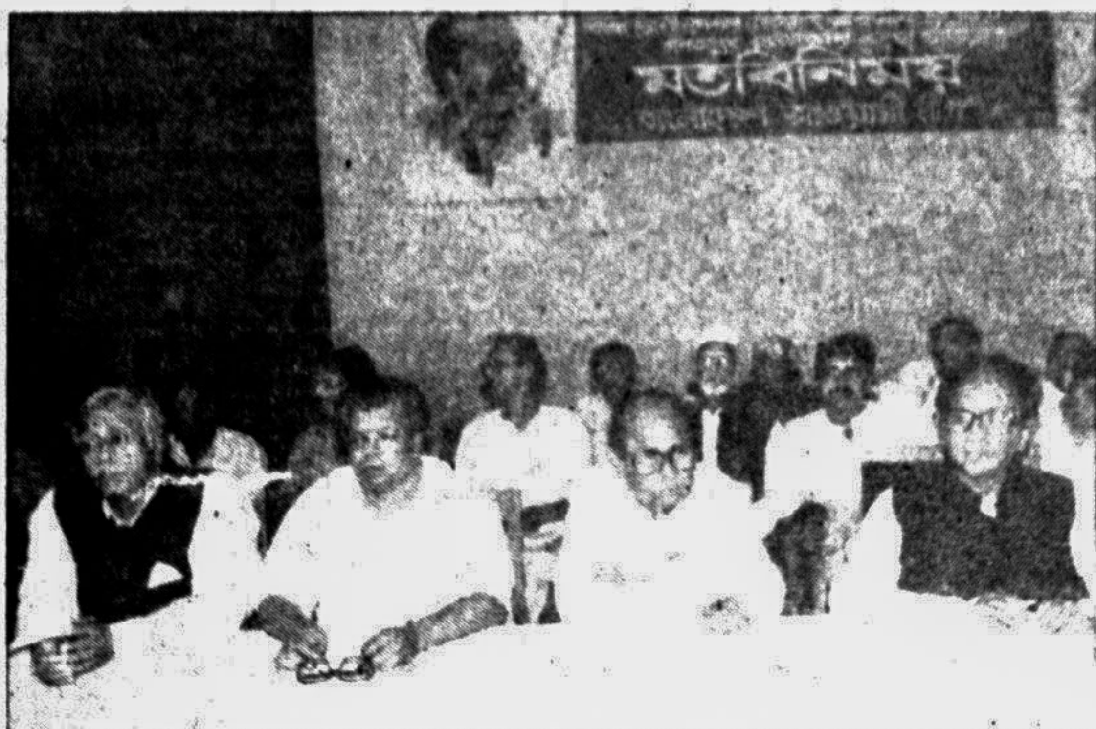
Awami League leaders exchanged views with representatives of different professional groups at the Engineers' Institution in the city yesterday.