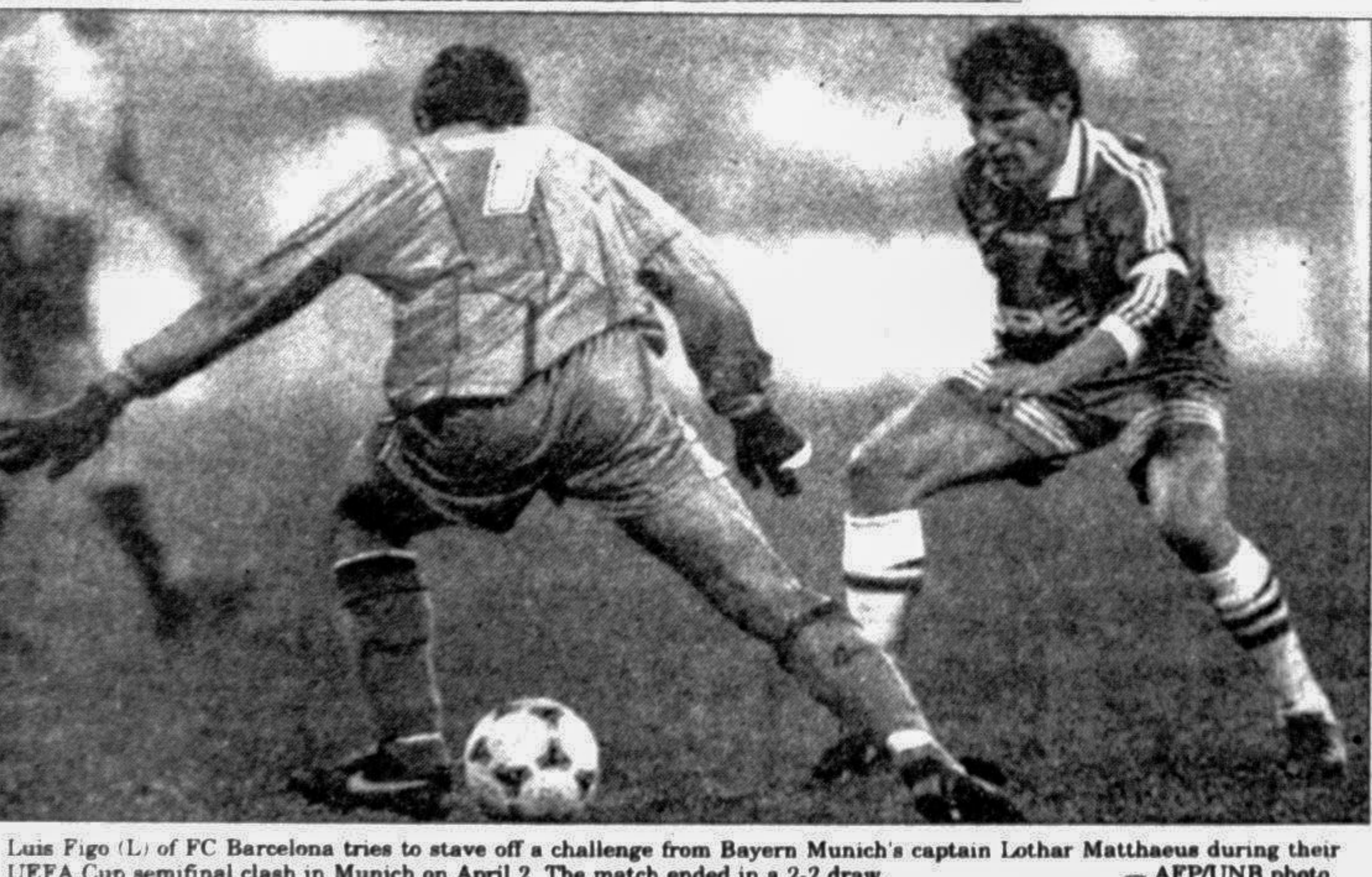
Luis Figo (L) of FC Barcelona tries to stave off a challenge from Bayern Munich's captain Lothar Matthaus during their UEFA Cup semifinal clash in Munich on April 2. The match ended in a 2-2 draw.