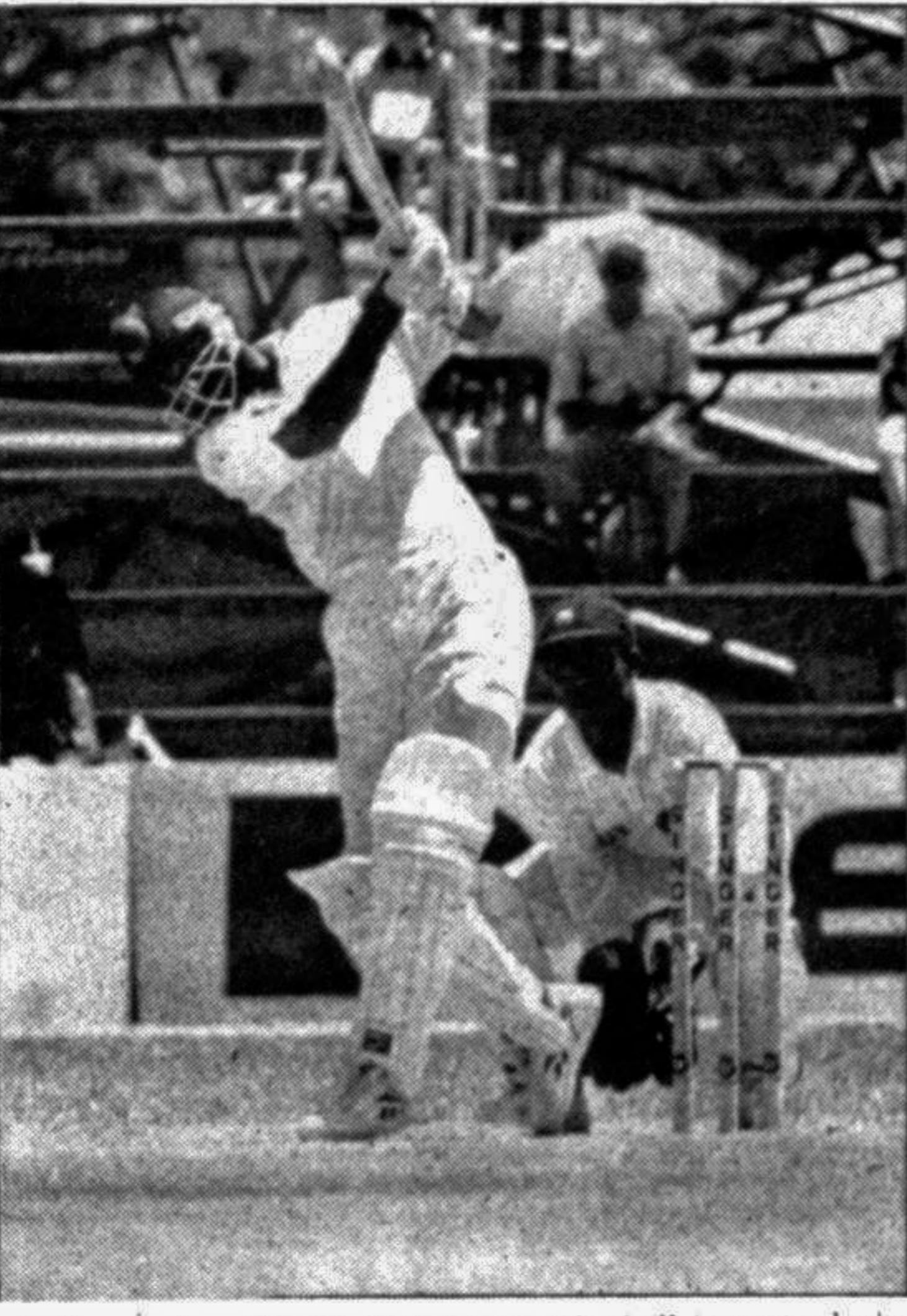
Indian saviour Navjot Sidhu drives the ball in yesterday's Singer Cup match against Sri Lanka at the Padang, Singapore. Sidhu scored an invaluable 94.

Singapore fans a glimpse of his awesome talent, scoring 28 in a 33-run partnership with Sidhu before becoming the first batsman to fall.