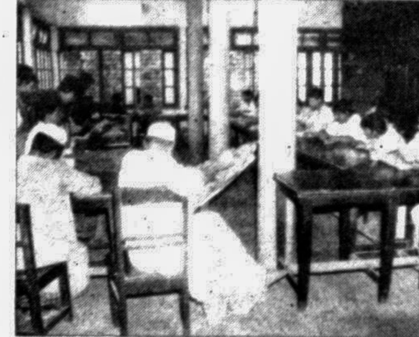
Readers inside the library