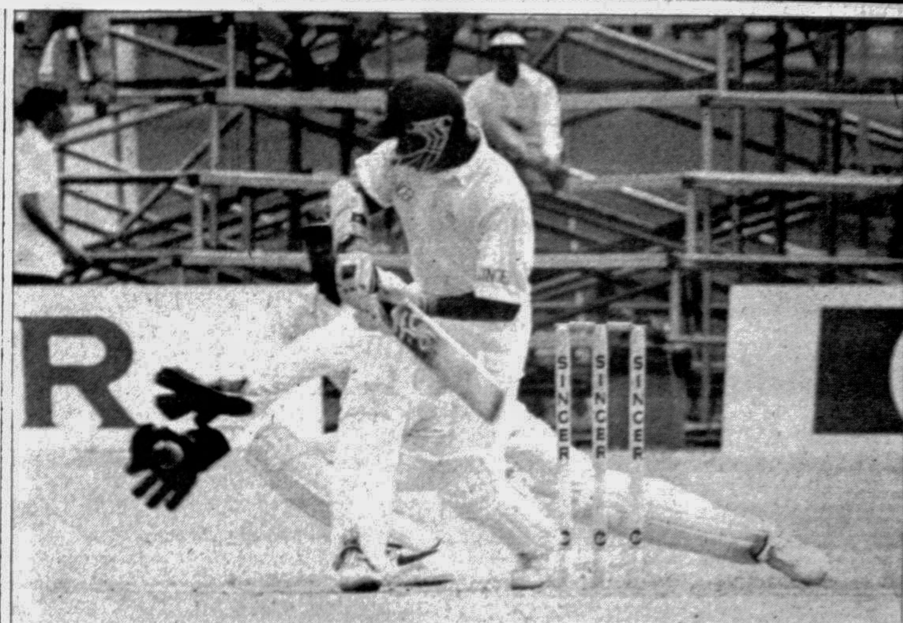
PERHAPS THE ONLY WAY TO CONTAMINATE HIM: Sri Lanka's explosive opener Sanath Jayasuriya, who shattered three one-day records in his whirlwind 134 off 65 deliveries in the Singer Cup opener against Pakistan, looks on at an wide delivery by an unidentified opponents' bowler at the Padang, Singapore on April 2.