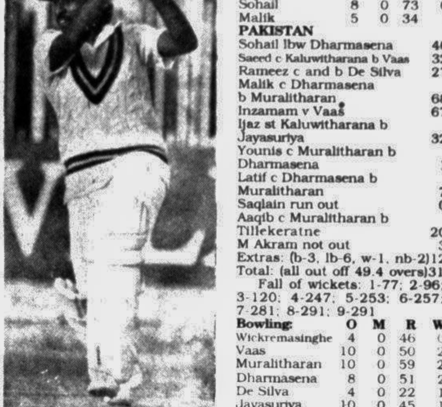
SALIM MALIK... 68 bowled by Chaminda Vaas, which included one massive six. Pakistan's hopes were virtually over.

But when Inzamam was bowled by Chaminda Vaas, which included one massive six, Pakistan's hopes were virtually over.