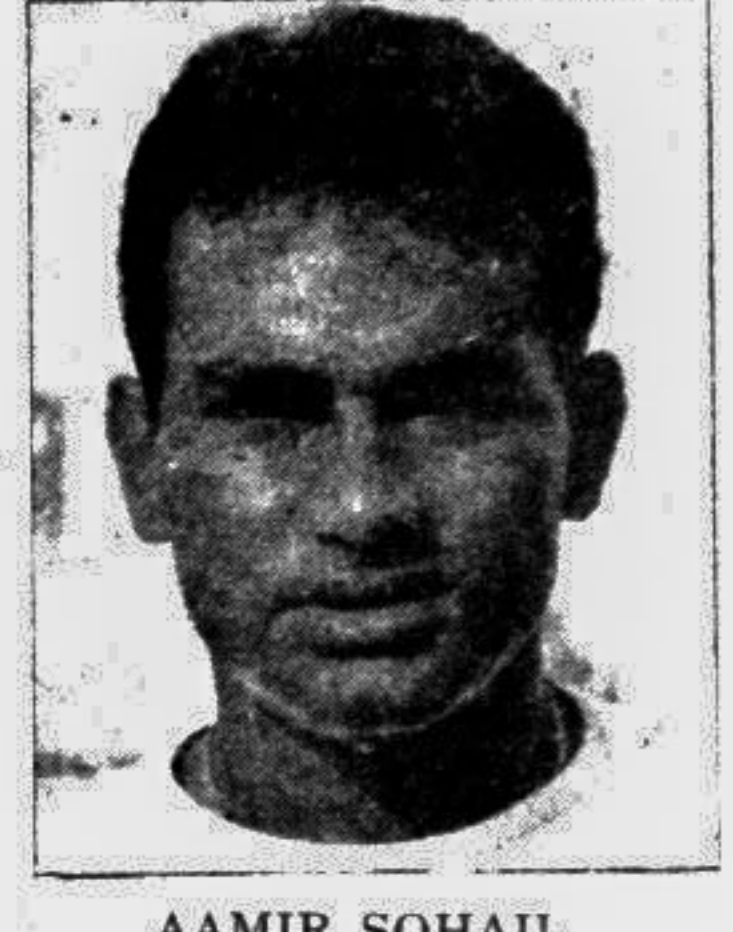
AAMIR SOHAIL Asanka Gurusinha, Sanath Jayasuriya, Ravindra Pushpakumara, Chaminda Vaas, Pramodaya Wickremasinghe, Upul Chandana, Marwan Sattaputa. PAKISTAN: (from) Aamir Sohail (capt), Saeed Anwar, Rameez Raja, Ijaz Ahmed, Salim Malik, Basit Ali, Inzamam-ul-Haq, Rashid Latif, Aaqib Javed, Ataur Rehman, Muhammad Akram, Mushtaq Ahmed, Saqlain Mushtaq, Waqar Younis.

TEAMS SRI LANKA: (from) Arjuna Ranatunga (capt), Aravinda Silva, Roshan Mahanama, Romesh Kaluwitharana, Muttiah Muralitharan, Hashan Tillekaranne, Kumara Dharmasena.