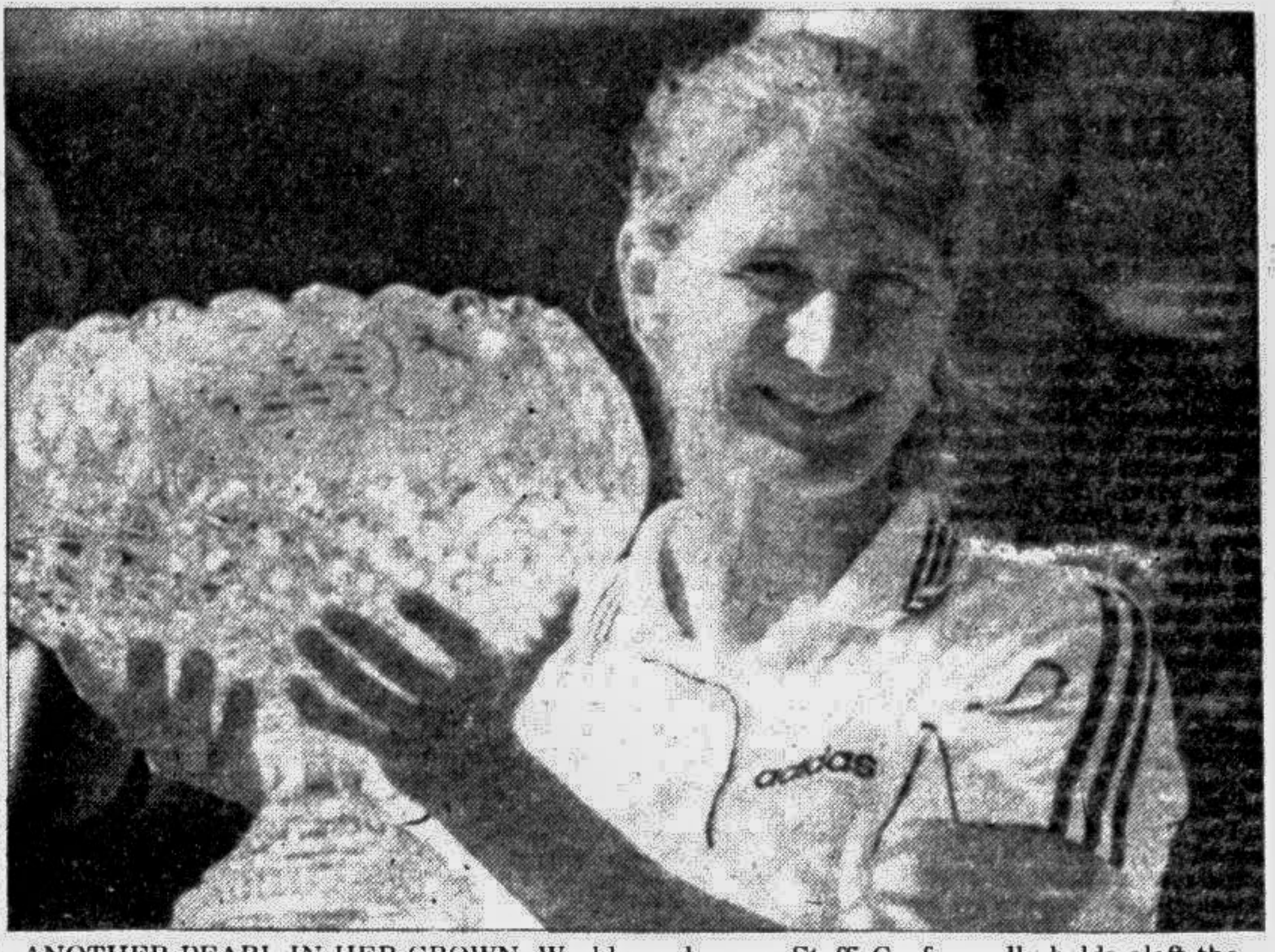
ANOTHER PEARL IN HER CROWN: World number one Steffi Graf proudly holds aloft the Lipton Championships trophy after winning the final against her American challenger Chanda Rubin in Biscayne, Florida, on March 30. The never-fading gritty German stooped the American teenager 6-1, 6-3.