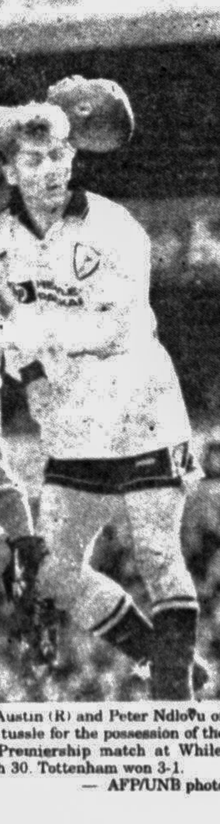
Tottenham Hotspurs' Dean Austin (R) and Peter Ndlovu of Coventry locked in an aerial tussle for the possession of the ball during their English Premiership match at White Hart Lane, London, on March 30. Tottenham won 3-1.

Shocking! MARSEILLE, France, Mar 31: The president of a French soccer club was shot dead and the coach wounded when four gunmen opened fire during a fifth division match in the southern town of Hyeres on Saturday, police said, reports Reuter. The unnamed club president from the Corsican town of Calvi, which was playing against Hyeres, was believed to have been the victim of a gangland feud. Roland Courbis, 43-year-old former coach of First Division soccer clubs Toulon and Bordeaux, was seriously wounded.