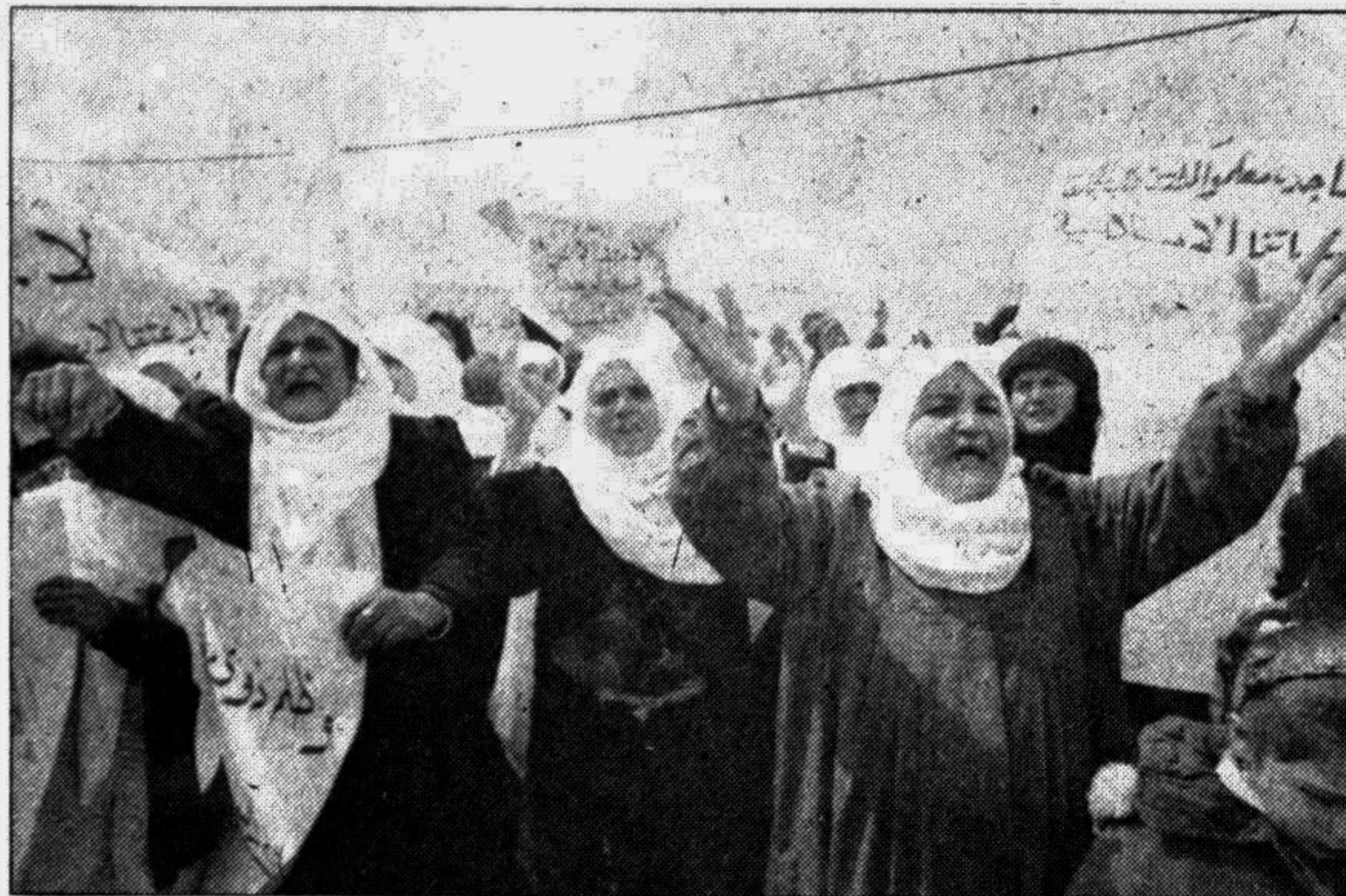
Palestinian women protest on Wednesday in the West Bank town of Ramallah with more than 200 supporters of the radical Islamic movement Hamas. The protesters demand the release of Hamas militants arrested by the Palestinian Authority since a wave of suicide bombing in Israel.