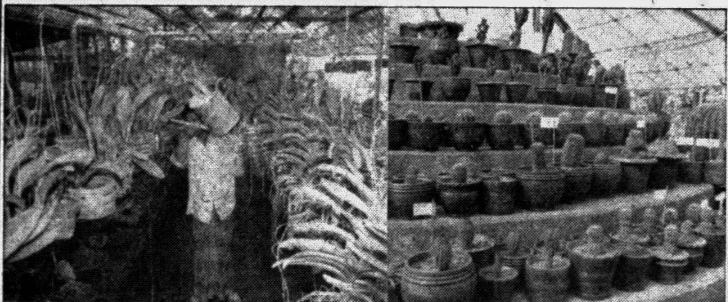
Watering the plants (left) inside the greenhouse, and a partial view of the dehydrated cactai in the Baldah Gardens.