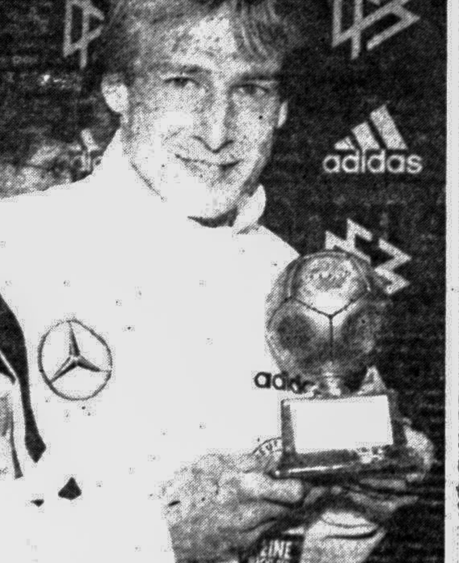
German soccer superstar Juergen Klinsmann, who had a successful international season for his country last year, proudly holds the "World top-scorer '95" trophy prior to the German national team's friendly match against Denmark in Munich on March 26. The prolific striker was awarded the trophy by the Federation for Soccer-History and Statistics.

"He's in the squad in his own right. His improvement has been very quick."