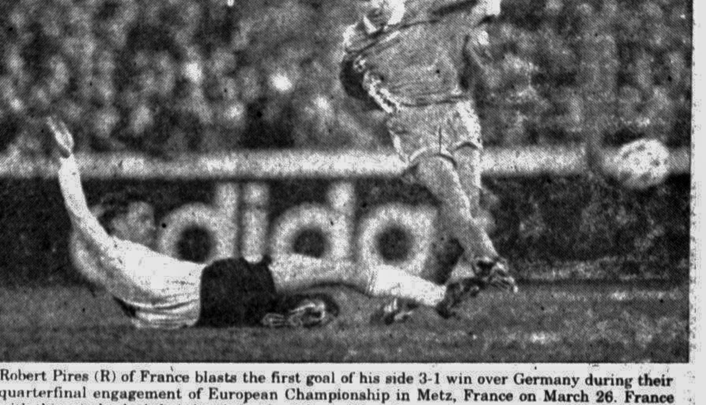
Robert Pires (R) of France blasts the first goal of his side 3-1 win over Germany during their quarterfinal engagement of European Championship in Metz, France on March 26. France with this win booked their berth for the Atlanta Olympics.

Two goals from Robert Pires, playing on his home pitch, and two more from Lyon striker Florian Maurice paved the way for a game from Bayern Munich's Christian Nerlinger.