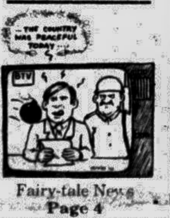
Fairy-tale News Page 4