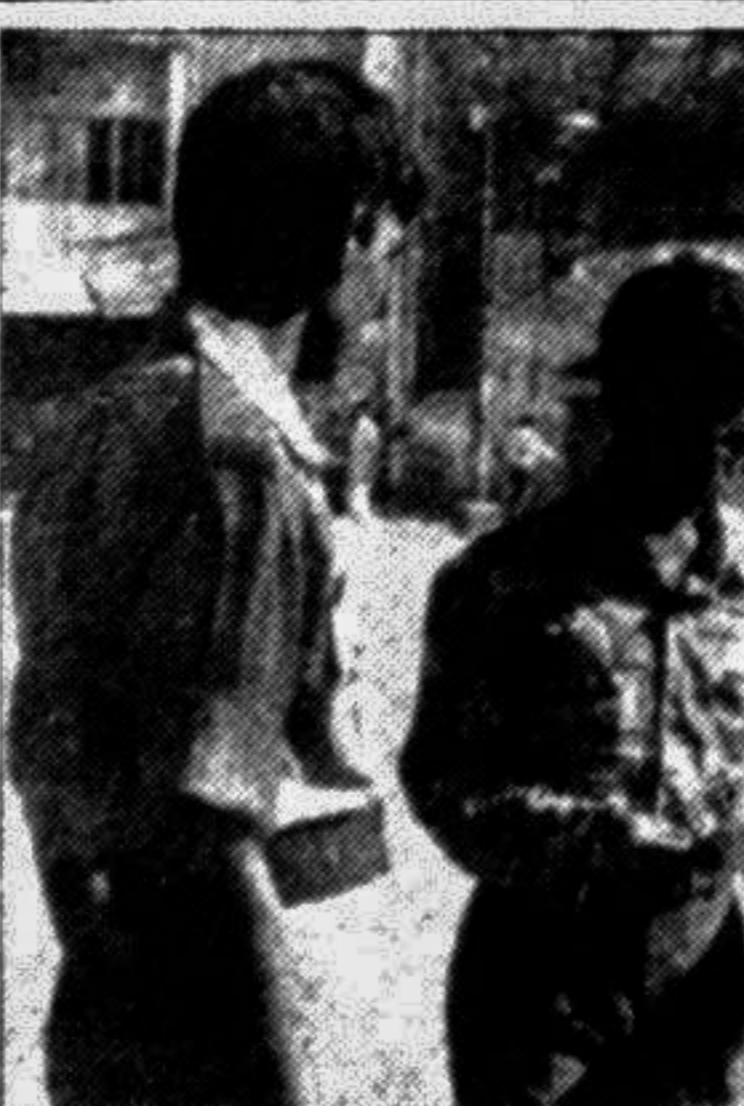
Police checking identity card of an employee of Bangladesh Secretariat yesterday.

The function was followed by screening of "Annaya Jibon", full length feature film of Sheikh Neyamat Ali.