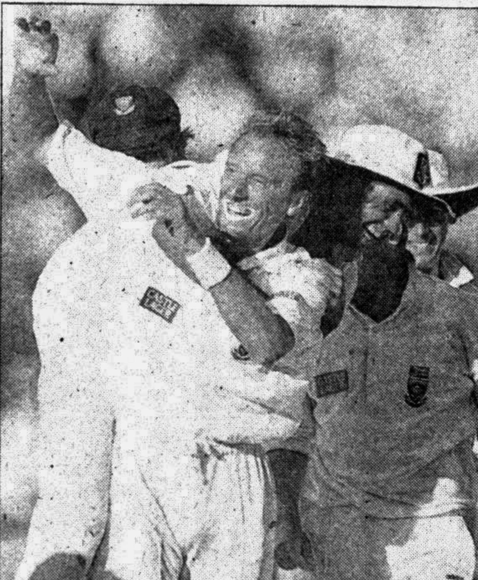
The South Africans in white.

Kassam should be back in Natal by now supporting Asian and black children to make it to big league cricket. "We are now treating the whites like they treated us before. Soon it will be apartheid reversed," added Kassam as a parting remark.