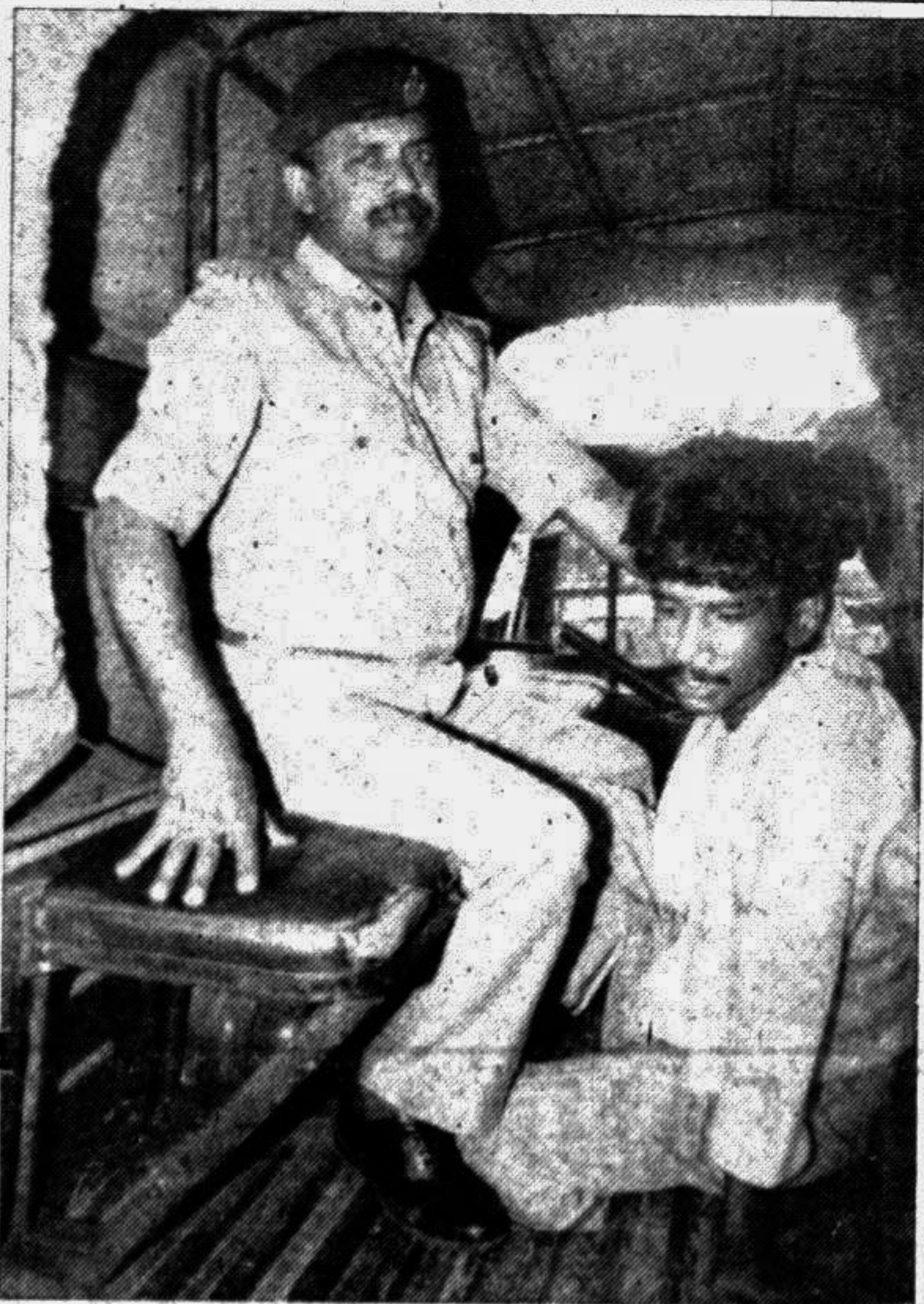
Police rounded up this mugger from city's Zero Point yesterday.