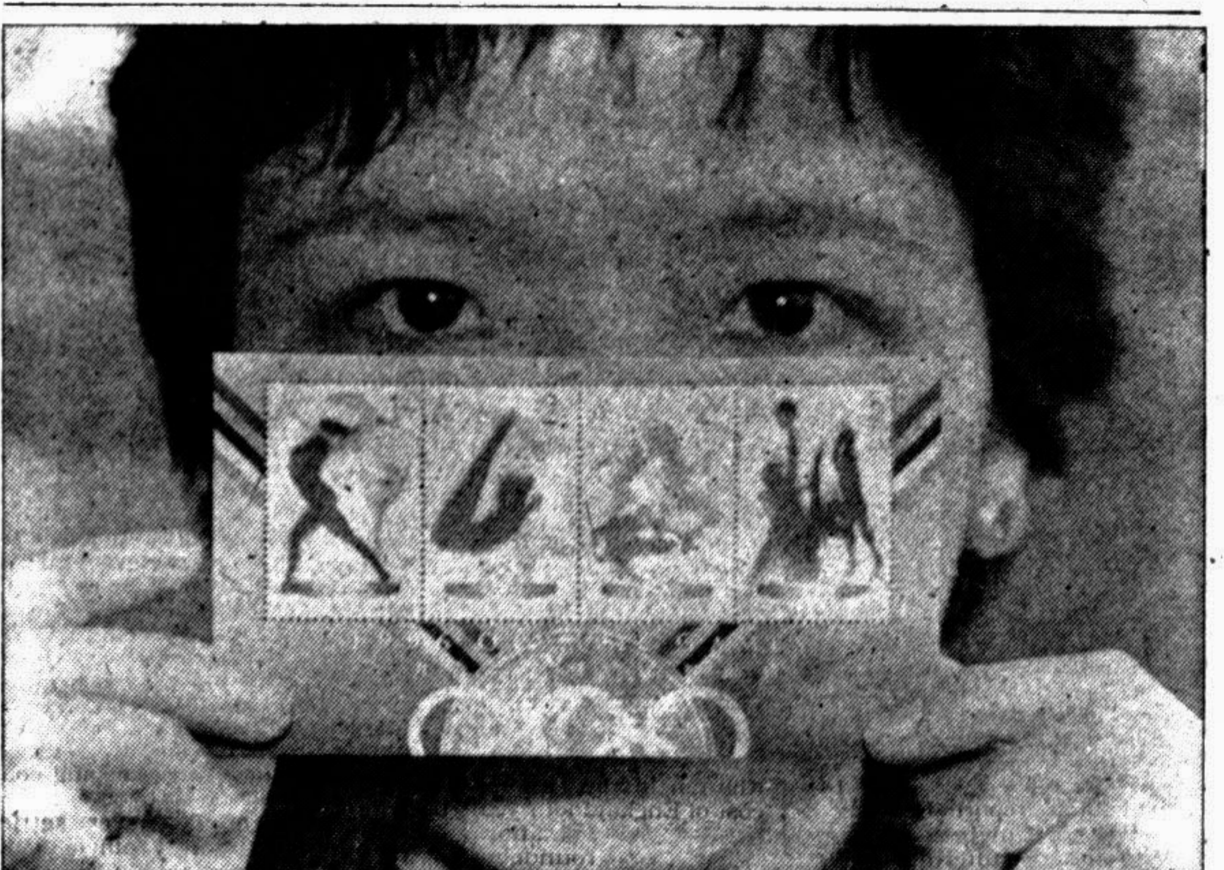
A post office worker displays the Olympic stamps issued by the Hong Kong Post Office to commemorate the 1996 Olympic Games in Atlanta. The stamps go on sale from today.