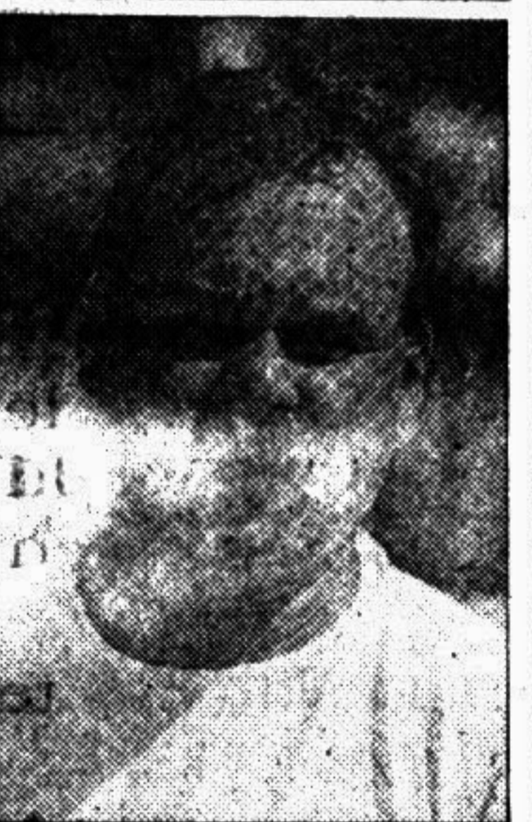
Dav Whatmore (Coach of Sri Lanka, the world champions)

I don't think Sri Lankans will be able to match people with the mouth - I don't like using the word 'sledge' but prefer 'verbalise'. The only way you can match people is with the bat and by fielding.