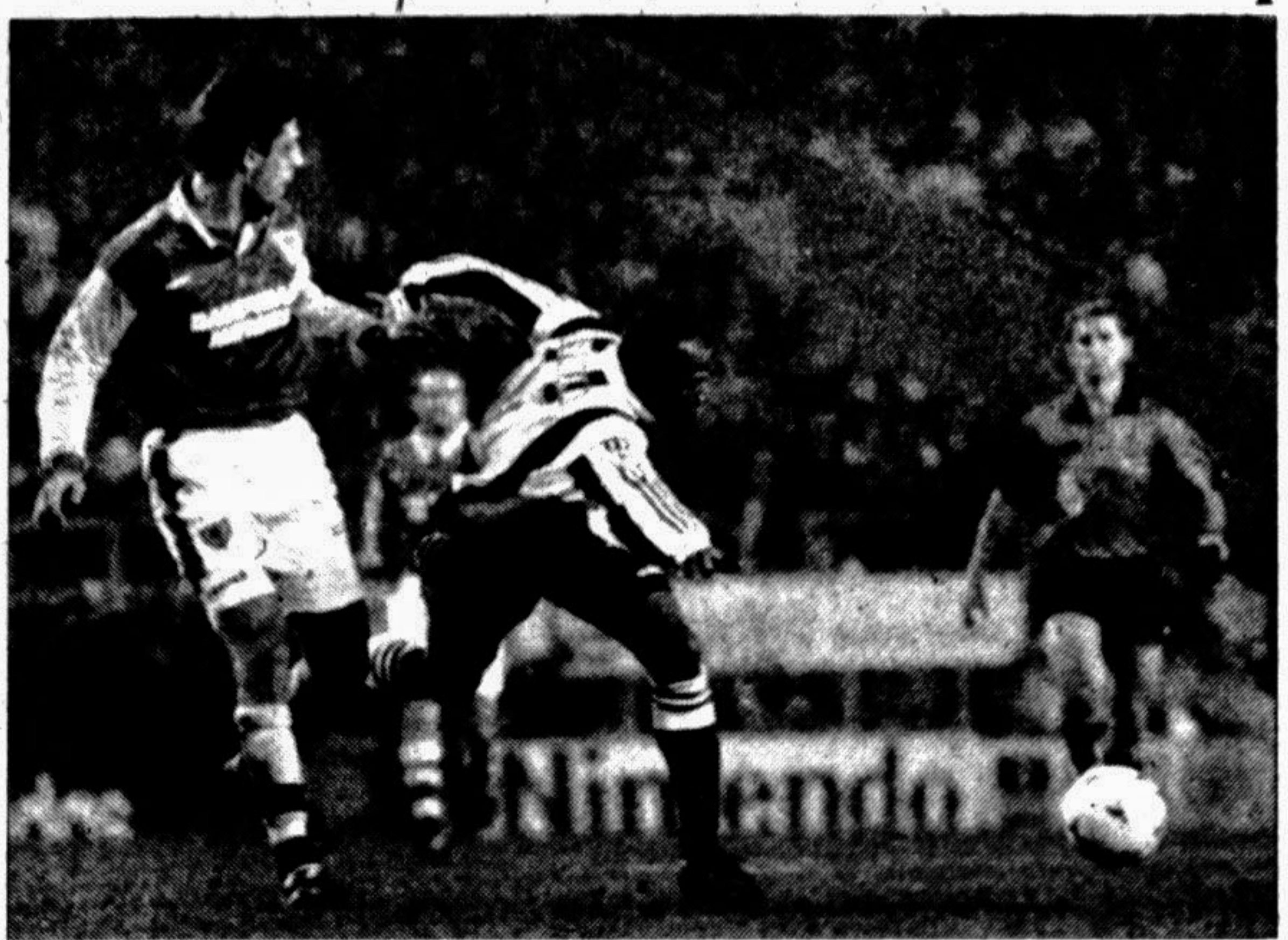
Fastino Asprilla (C), Newcastle hero of the night scampers for the ball during an English Premier League encounter against West Ham at St James Park, Newcastle, on Mar 18. The Colombian international scored one goal and made another as Newcastle won 3-1.