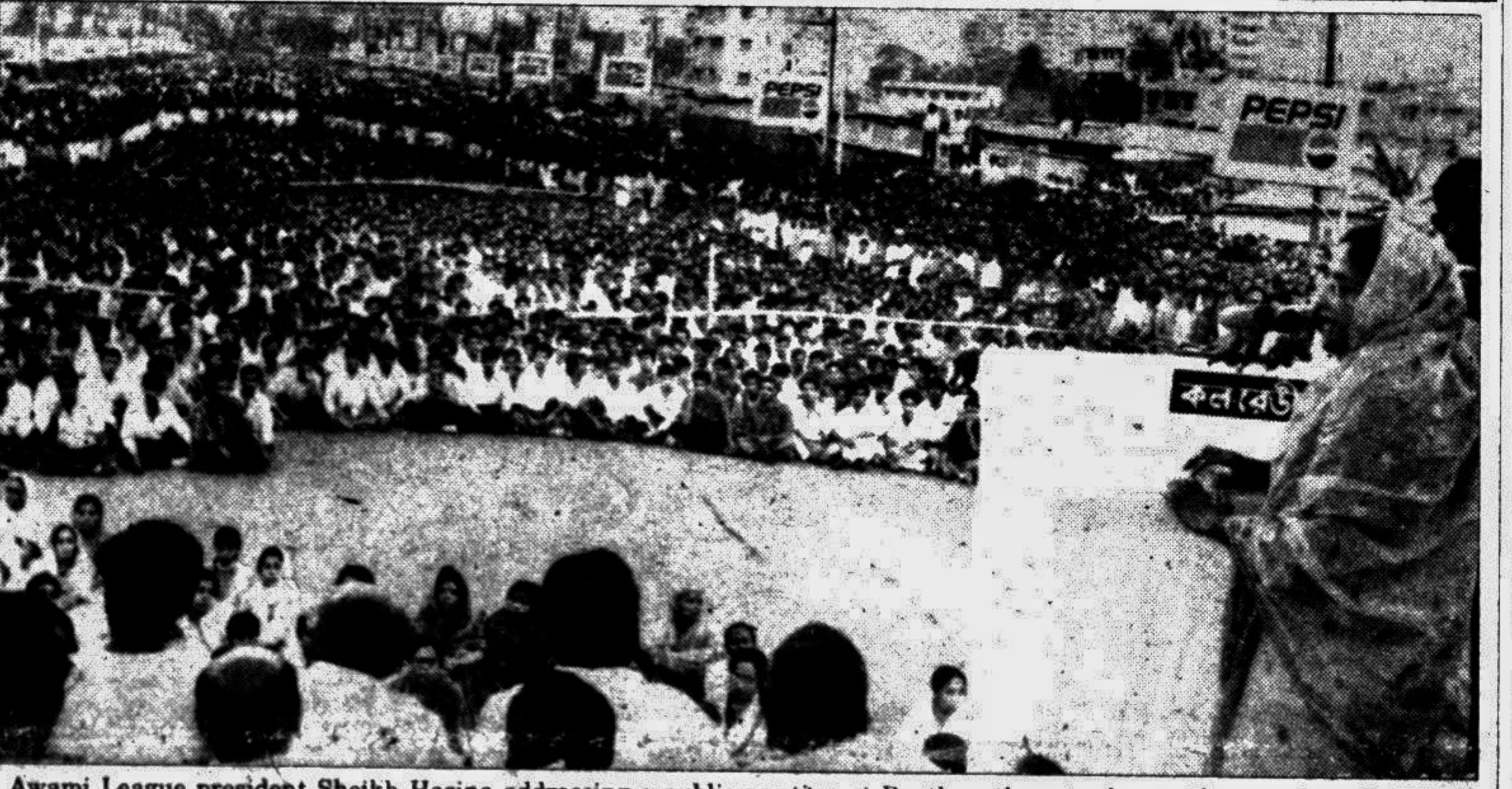
Awami League president Sheikh Hasina addressing a public meeting at Panthapath yesterday on the occasion of 76th birth anniversary of Bangabandhu Sheikh Mujibur Rahman Sunday.

By Staff Correspondent Awami League chief Sheikh Hasina yesterday urged the President to make a reference to the Supreme Court regarding formation of a caretaker government for holding elections for the sixth Parliament. Reiterating her demand for scrapping the February 15 'farjical' polls, the AL President said, "Peace can be restored in the country if the President initiates a reference to the Supreme Court." Sheikh Hasina was addressing a big rally at the Panthapath in the city yesterday, organised by the AL to mark the 76th birth anniversary of Bangabandhu Sheikh Mujibur Rahman. Senior party colleagues joined the AL chief in paying tributes to the memory of Bangabandhu. Amidst anti-government slogans by party supporters, Hasina called upon the government to 'stop bloodshed and meet people's demands immediately'. Without directly referring to the move initiated by President Abdur Rahman Biswas, at the request of the Prime Minister, for resolving the present political crisis through talks, the AL chief said: "The President betrayed the Opposition as well as the people by summoning session of the Jatiya Sangsad, constituted illegally through an election of vote-rigging." Awami League along with its two major movement-partners - Jatiya Party and Jamaat-e-Islami, said they would demand a reference to the Supreme Court for holding fresh elections.