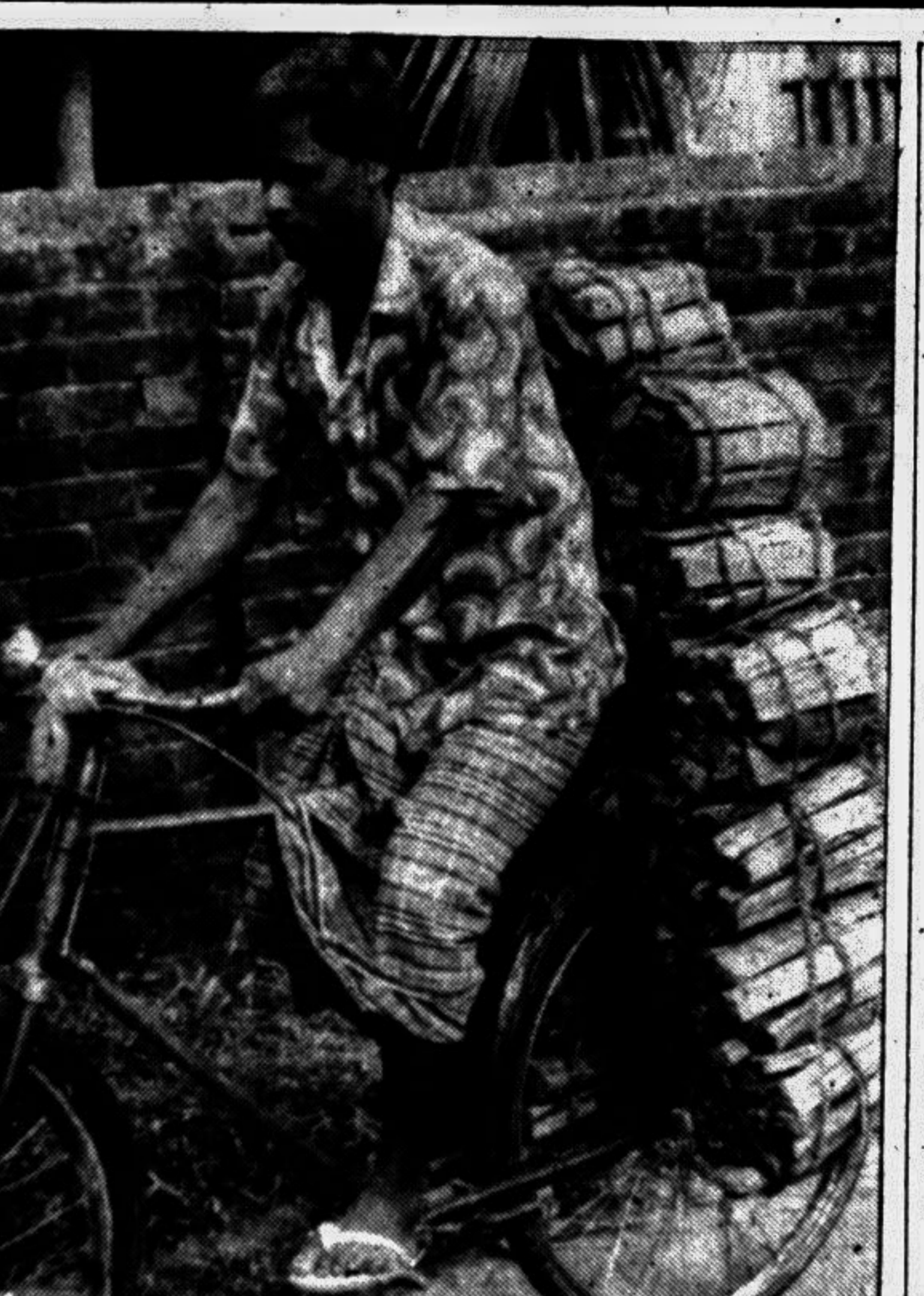
Bundles of fire-wood being carried on a bi-cycle for use at home in Sherrpur. An acute scarcity of fire-wood prevailing in the area.

Yunus, is mother Amena Begum, 70, and brother Abdul Jalil, 25, were stabbed by their rivals during the clash. Yunus died on the way to hospital. The injured were admitted to Rajapur Hospital.