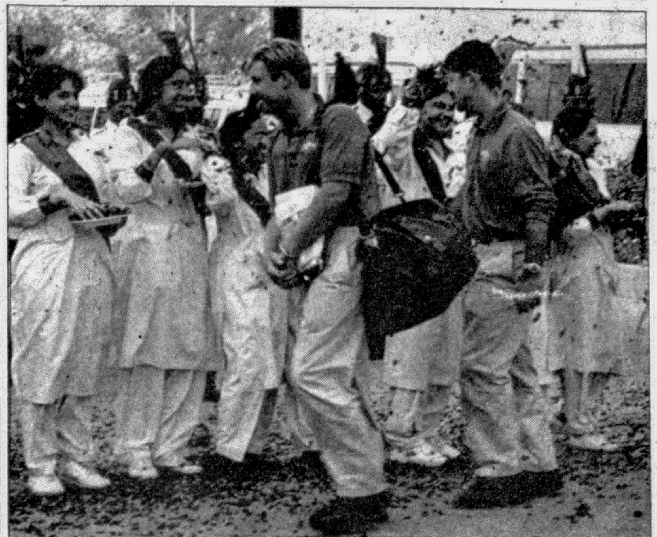
School girls welcome the Australian cricketers with flower petals on their arrival in Lahore on March 15. Australia meet Sri Lanka in the final here today.

Australian opener Mark Waugh, who i success is all in the mind. "We have won