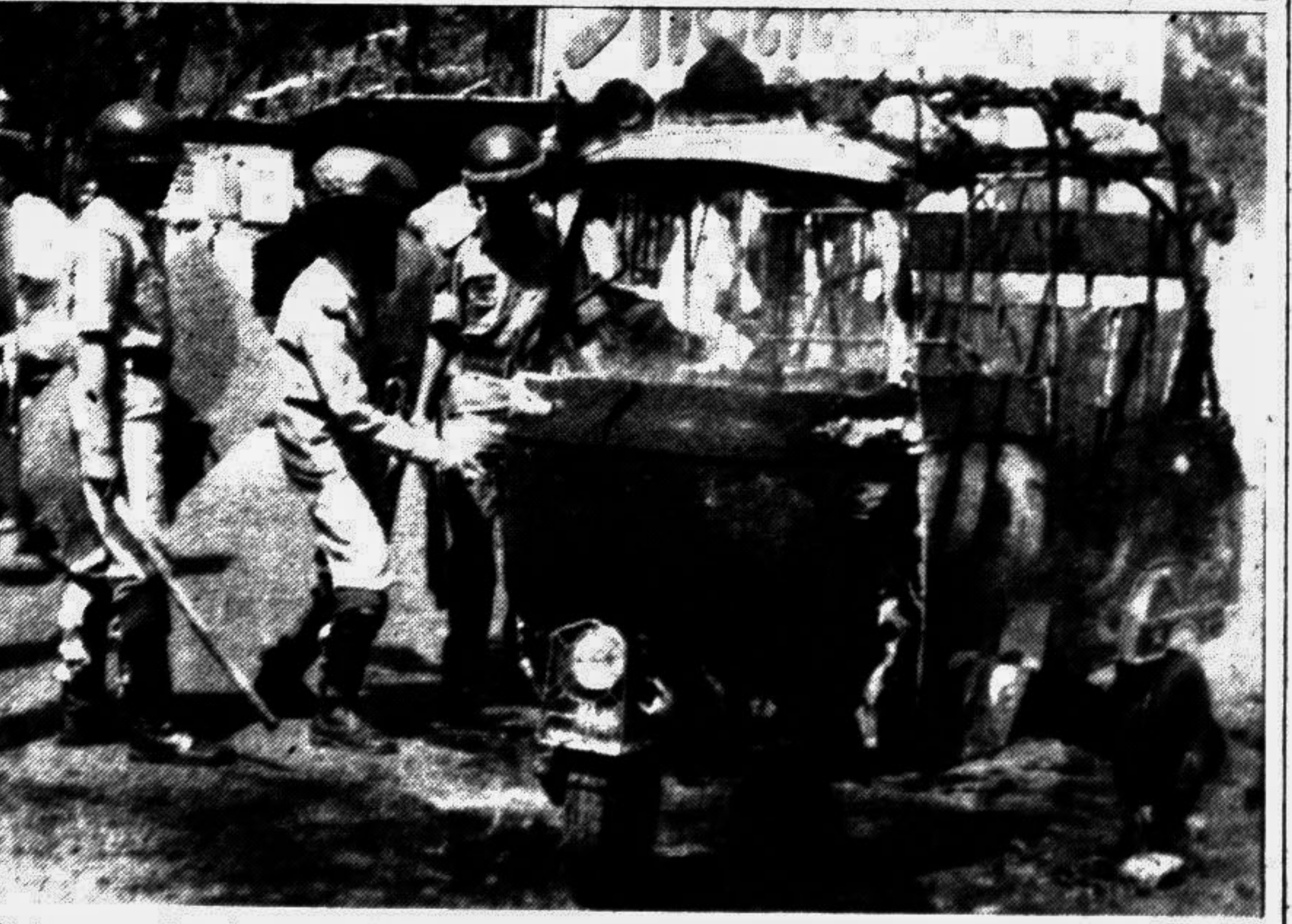
Pickets set afire this autorickshaw in city's Bangabandhu area yesterday.