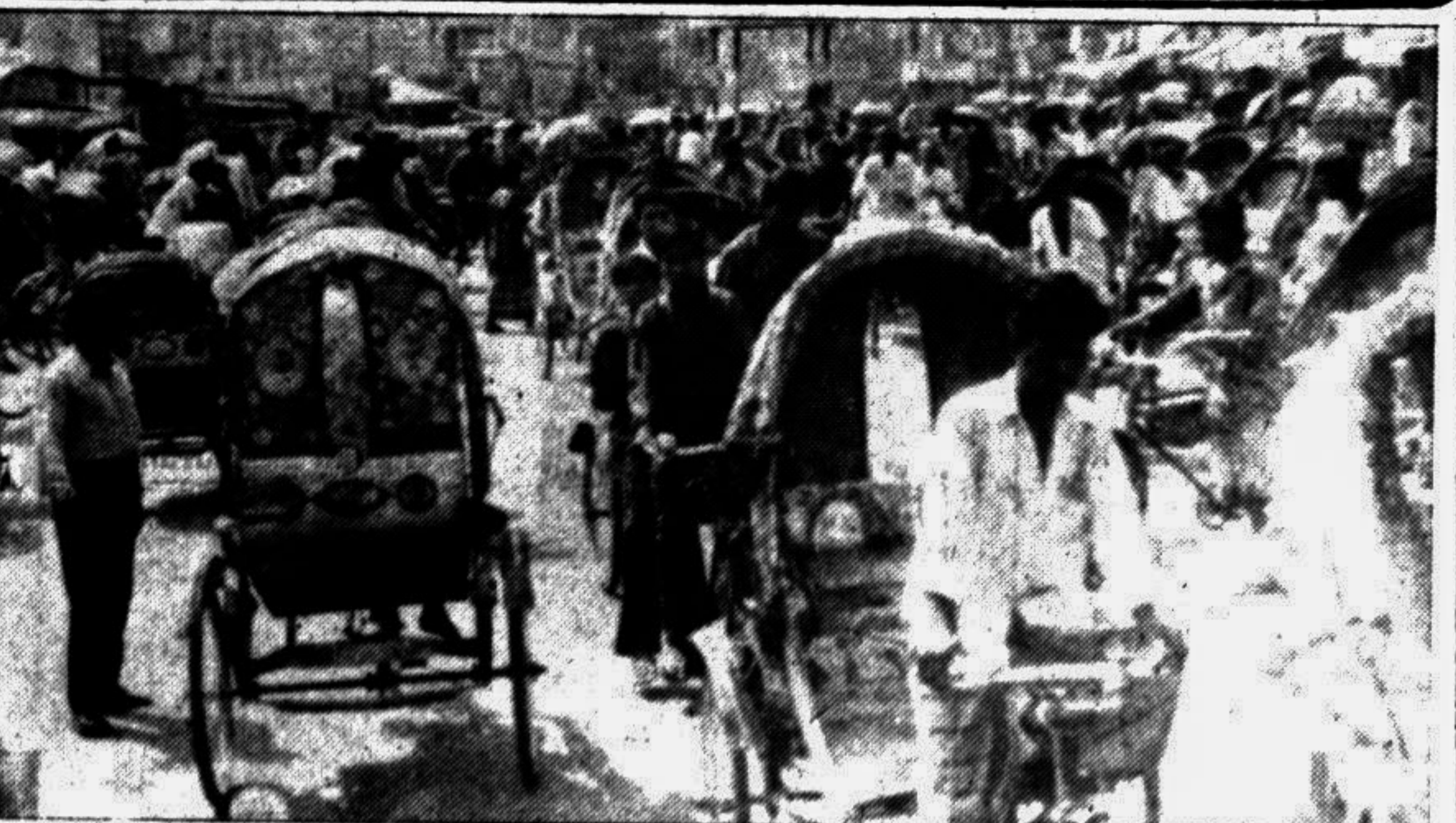
A good number of rickshaw plied in the city yesterday.