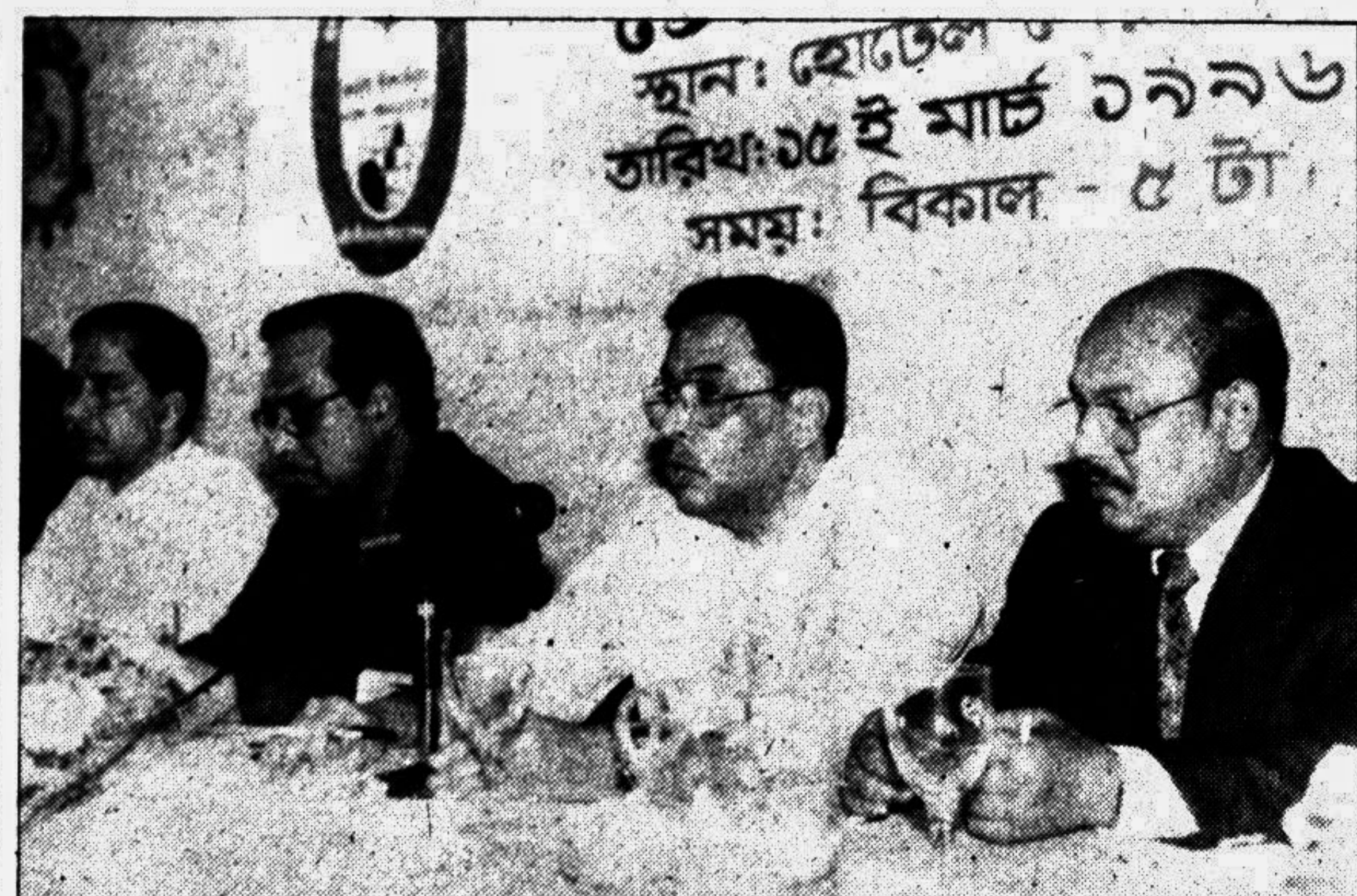
Minister for Health and Family Welfare Chowdhury Kamal Ibn Yusuf speaking at a press conference called by UNICEF at Sheraton Hotel yesterday.