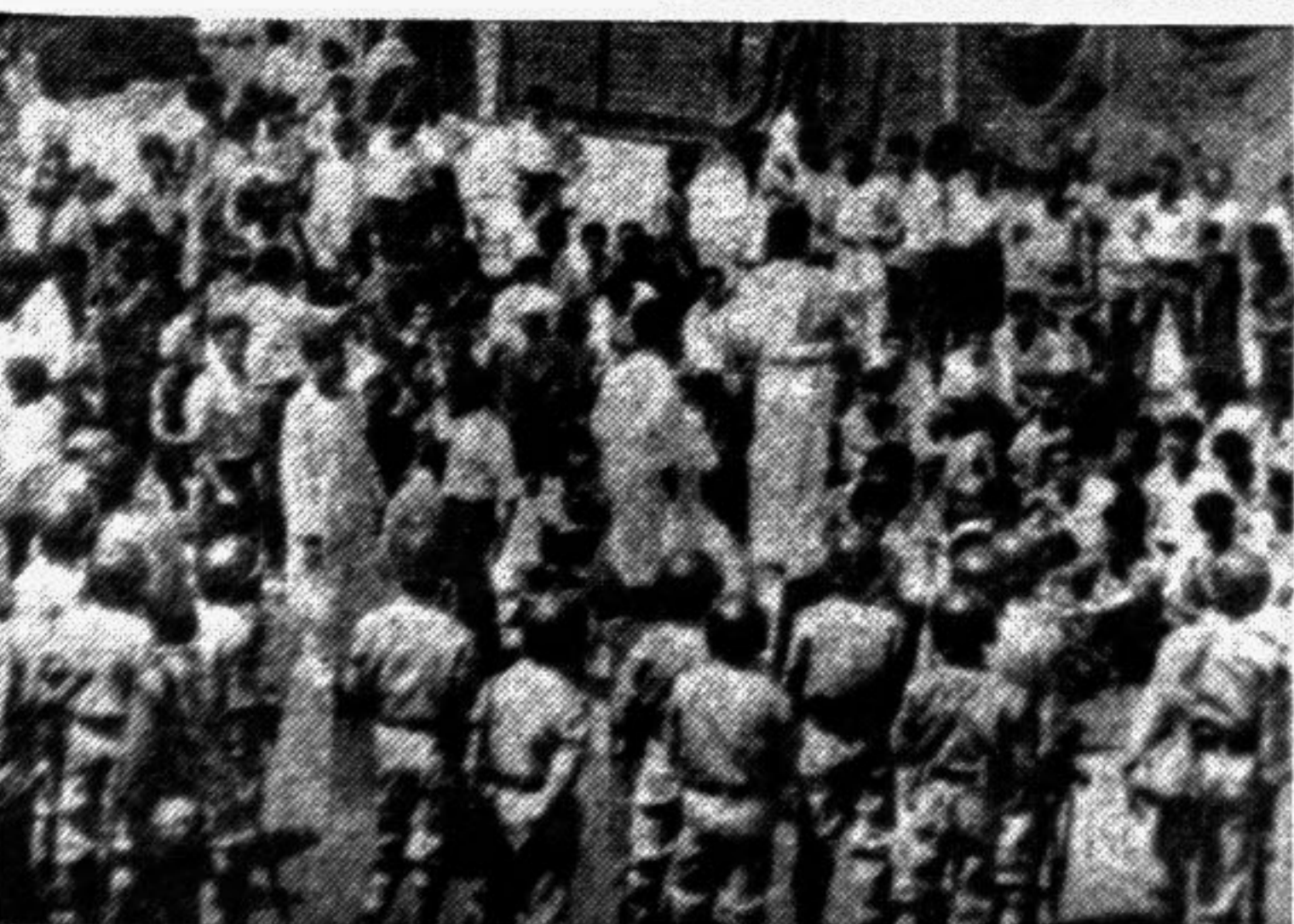
Intercepted by police the Awami League-backed Chhatra League held a rally in front of the Police Bhaban in the city yesterday.

Consumers Association of Bangladesh (CAB) yesterday called upon the consumers of the country to be united for establishing their rights, reports BSS. In a statement here on the eve of the World Consumers Day, CAB also urged the government to implement rights of consumers which were recognised internationally. It also strongly suggested formulation and implementation of consumers laws and guidelines in the greater interest of the nation, a CAB press release said.