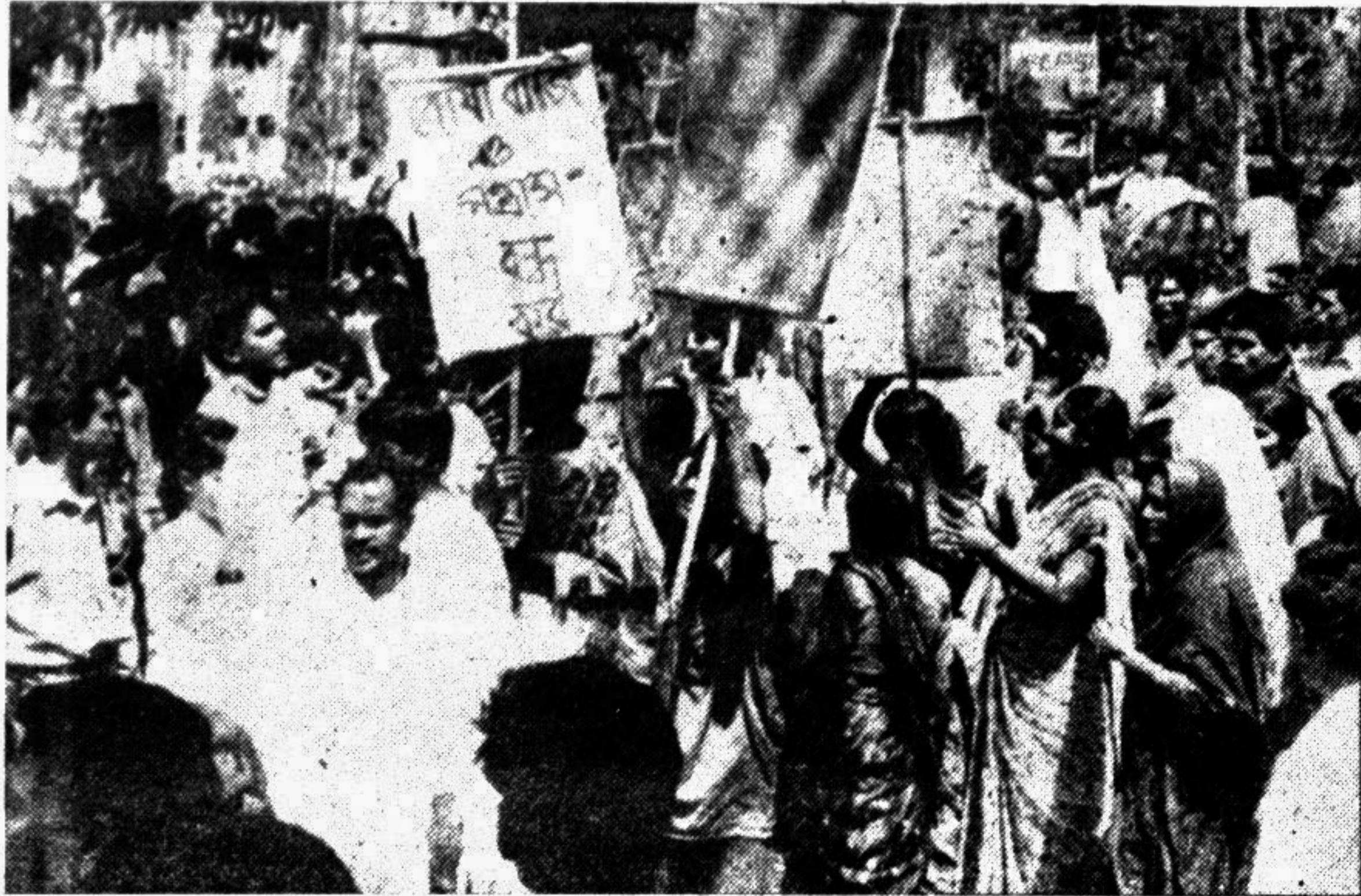
A group of workers brought out a procession in city's Dhankhondi area protesting opposition's ongoing non-cooperation programme against the government.

Temporary rain or thundershower accompanied by gusty wind may occur at one or two places over Sylhet division during the next 12 hours till 6 pm today reports UNB. Mild heat wave is likely to sweep over the country's northern region. Weather may remain mainly dry elsewhere over the country while day temperature may rise by 1-2 degree Celsius during the period, Met Office said. Country's highest temperature 36.2 degree Celsius was recorded yesterday at Dhaka and Khulna and the lowest 17.2 degrees at Dinajpur. The sun sets in Dhaka today at 6:08 pm and rises tomorrow at 6:09 am. The highest and lowest temperatures and humidity recorded in some major cities and towns yesterday were: City/Town Temperature in Celsius Humidity in percentage Max Min Morning Evening Dhaka 36.2 24.2 77 30 Chittagong 30.5 23.8 70 73 Rajshahi 35.5 20.4 44 49 Khulna 36.2 23.0 73 50 Barisal 34.3 25.0 77 65