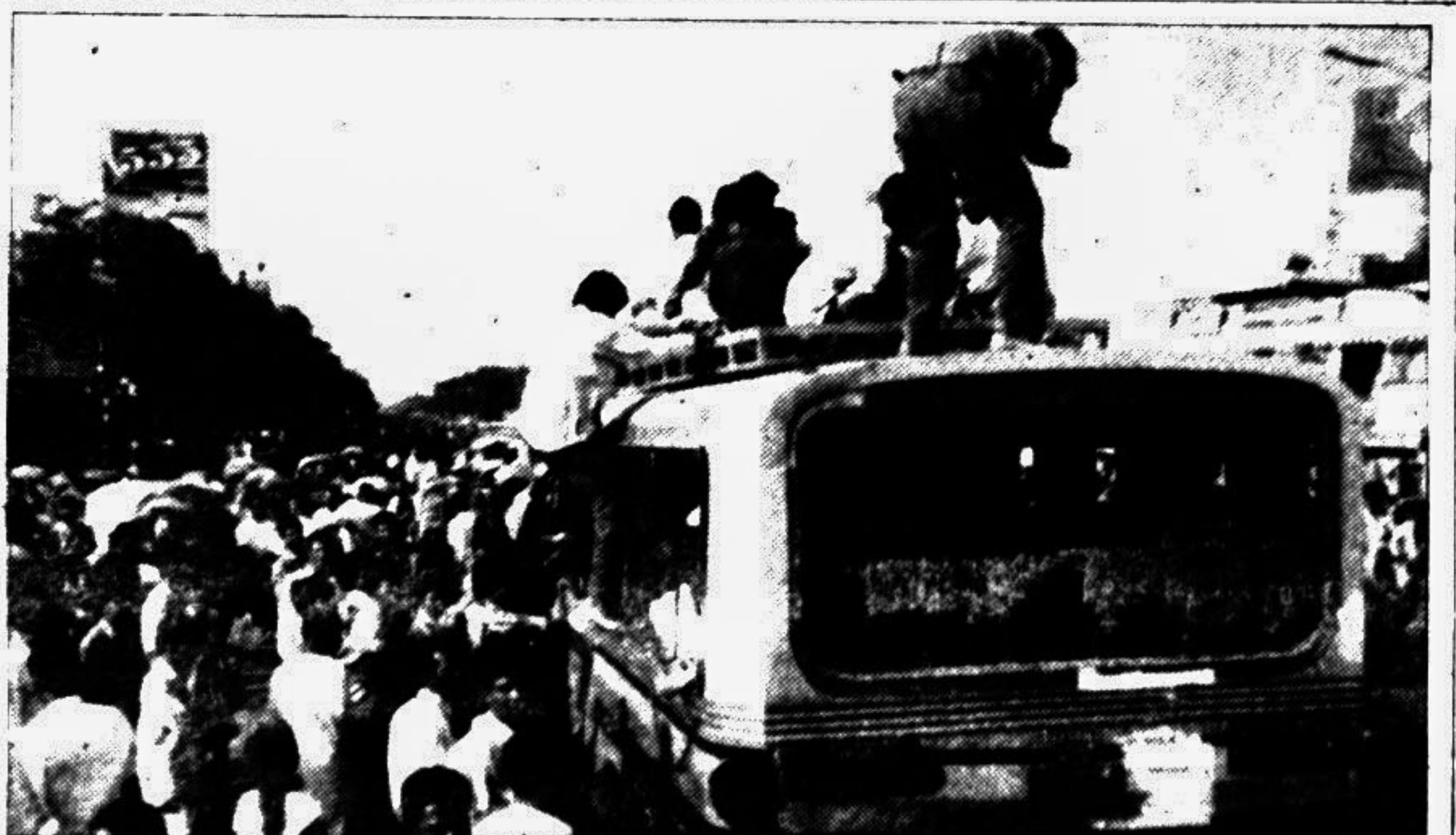
Passengers rushed to the inter-district bus terminal yesterday as the opposition released their non-cooperation programme after 2 pm. This picture was taken from city's Mohakhali area.

The rally was addressed by Moniruzzaman Monir, Shahid Uddin Chowdhury Amir, BSM Mosharrar Hossain and Monir Hossain.