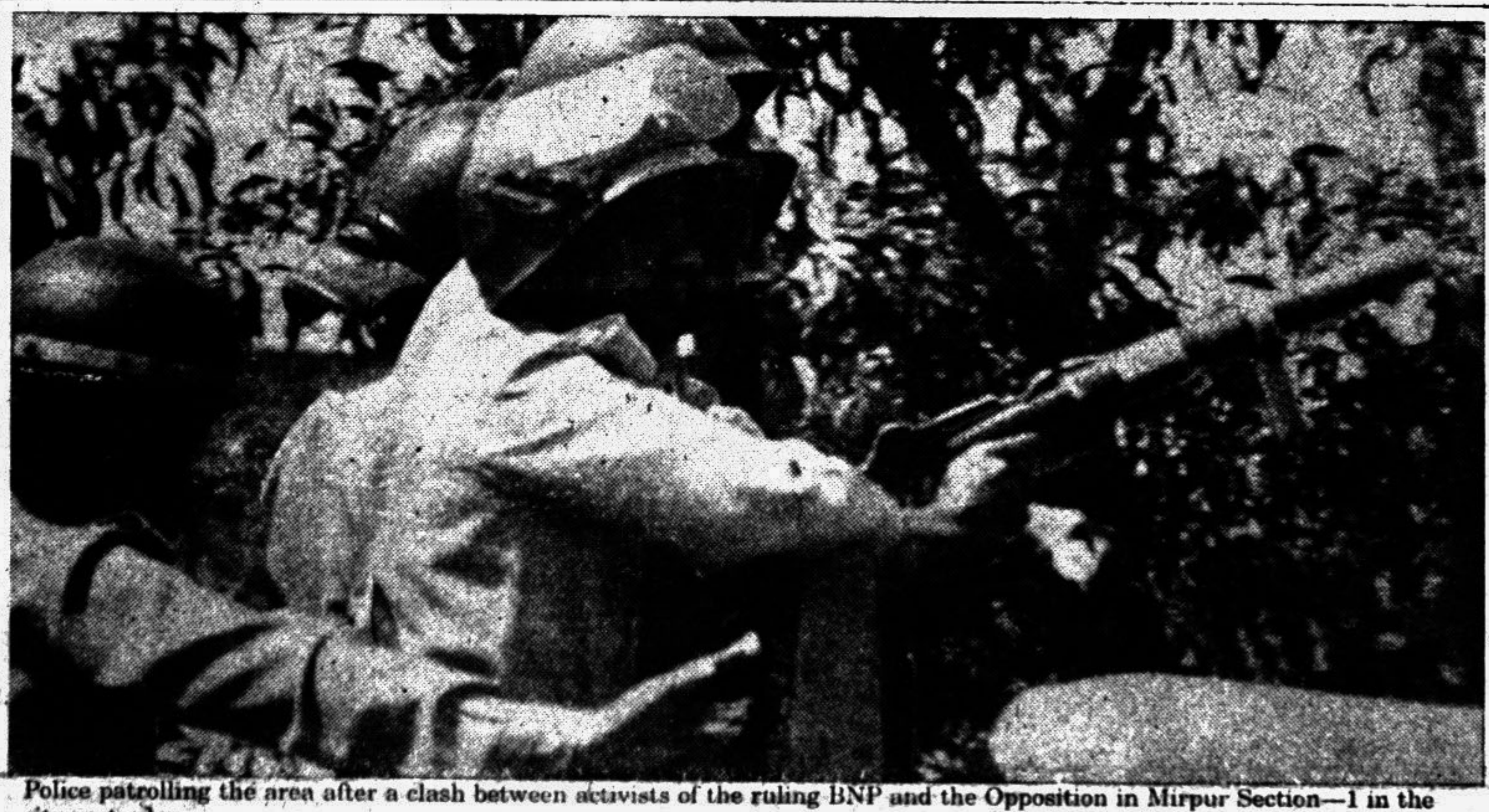
Police patrolling the area after a clash between activists of the ruling BNP and the Opposition in Mirpur Section-1 in the city yesterday.

CALCUTTA, Mar 13: India's World Cup dream ended in disgrace today after furious home fans rioted during the semi-final and forced match officials to award the game to Sri Lanka, report AFP. The 110,000 Eden Gardens crowd began flinging projectiles on to the pitch and lighting fires in the stand as India, chasing 251 for eight, slumped to 120 for eight. That collapse, which saw seven wickets tumble for 22 runs, was too much for the home supporters. Sri Lanka's players huddled in the middle of the pitch for protection as riot police were rushed in to try and restore order. The players were then led off by match referee Clive Lloyd. Lloyd said: "It is in my remit to award the match to Sri Lanka. I am very disappointed." An attempt to restart the Match 15 minutes later was aborted as fans again began to fling projectiles at a Sri Lankan fielder. Indian batsman Vinod Kambli was led off the pitch in tears as it was announced the match had been abandoned. Banners began to appear in the crowd, saying: "We are sorry, congratulations Sri Lanka." But the irreparable damage to India's sporting reputation had been done. Sri Lanka will now play the winners of tomorrow's game between Australia and the West Indies. The evening took on a surreal feel as an award ceremony went ahead on the pitch as police continued to patrol the stands and put out fires. Television commentator See Page 12 Col 4