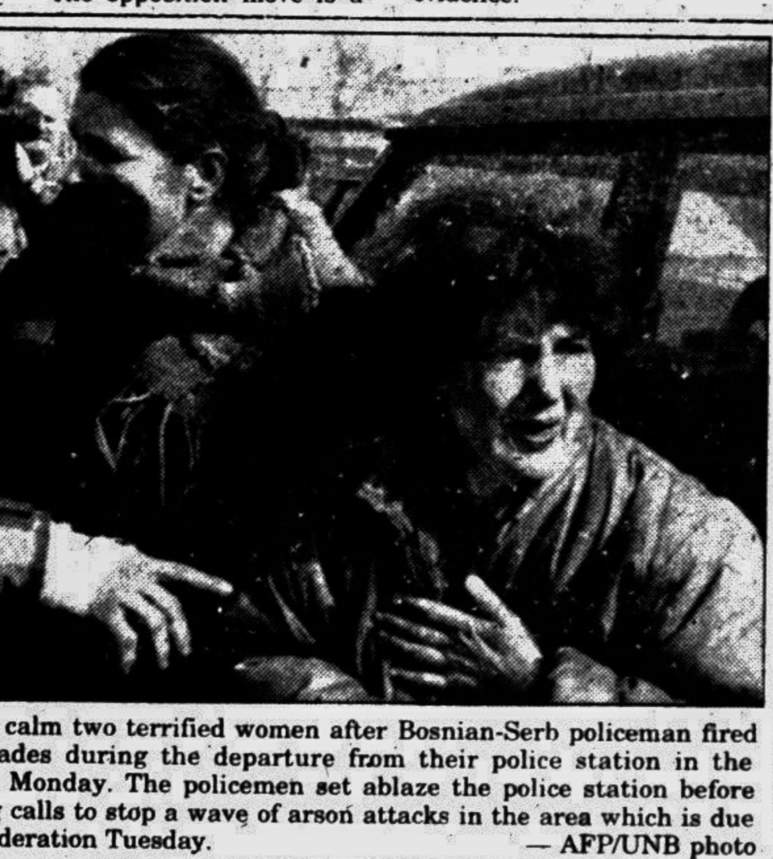
A French IFOR soldier tries to calm two terrified women after Bosnian-Serb policeman fired guns and detonated hand grenades during the departure from their police station in the Sarajevo suburb of Ildiza, on Monday.

Muslim-Croat fed takes over Sarajevo suburb from Serbs: ILLIZA, Bosnia-Herzegovina, Mar 12: Bosnian Serb residents of this Sarajevo suburb have left behind a virtual ghost town for the Muslim-Croat federation that takes over Tuesday, reports AP.