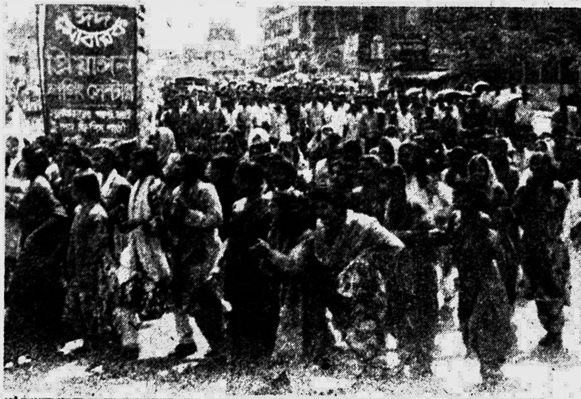
The Jatiyatantra Chhatra Dal brought out a procession in the city yesterday, welcoming the PM's proposals to solve the country's present political crisis.

During those times one can't help comparing the relatively simple church weddings with our elaborate, lavish ones.