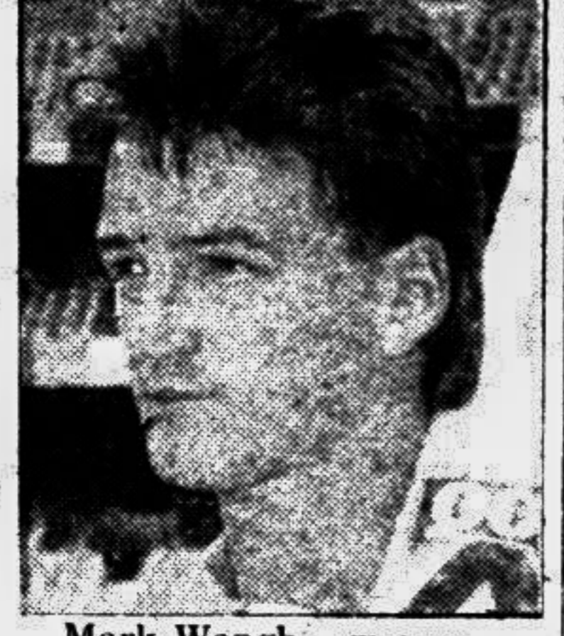
Mark Waugh... m-o-m